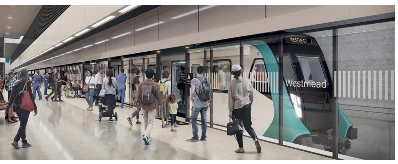
Artist's impression of Westmead metro station.

Work on Sydney Metro West is set to start in 2020 - bringing world-class metro rail to Western Sydney.