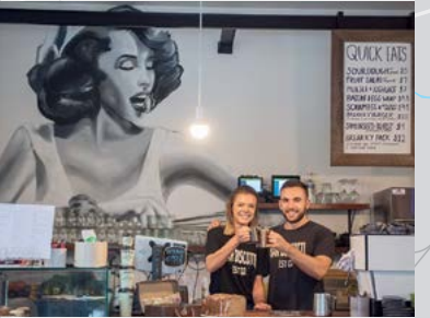
A North Strathfield cafe

The proposed North Strathfield metro station would be adjacent to the existing North Strathfield Station. New metro platforms would sit alongside the existing station and entry to the station would be from a new entrance on Queen Street.