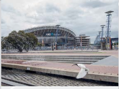
Sydney Olympic Park.

The proposed Sydney Olympic Park metro station would be located to the south of the existing Olympic Park Station. The station would sit to the east of Olympic Boulevard with the main station entrances between Herb Elliot Avenue and Figtree Drive, and off Dawn Fraser Avenue.