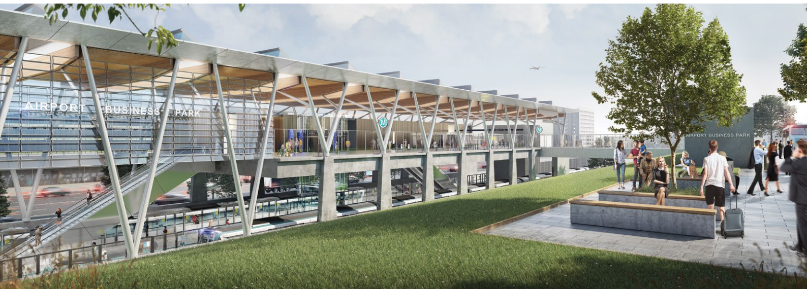
An artist's impression of Airport Business Park Station.