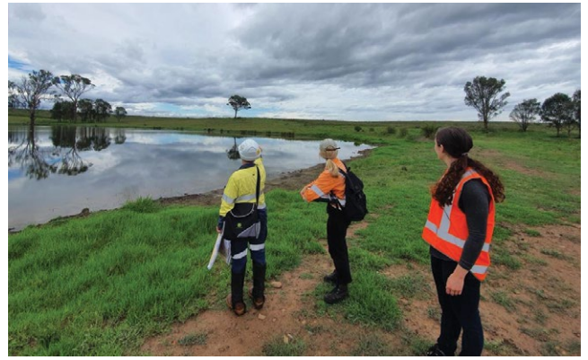
Sydney Metro surveying works in Luddenham.

Place Managers can be contacted on 1800 717 703 or sydneymetrowsa@transport.nsw.gov.au