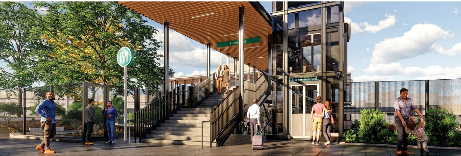
An artist's impression of Punchbowl Station.