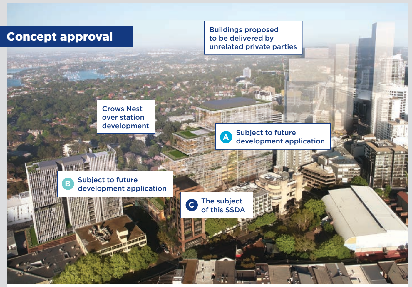
An artist's impression of the approved Crows Nest over station development proposal showing Site C. Subject to change as project progresses.