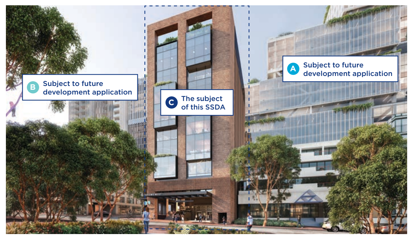
An artist's impression of the Crows Nest over station development proposal showing Site C on Clarke Street.