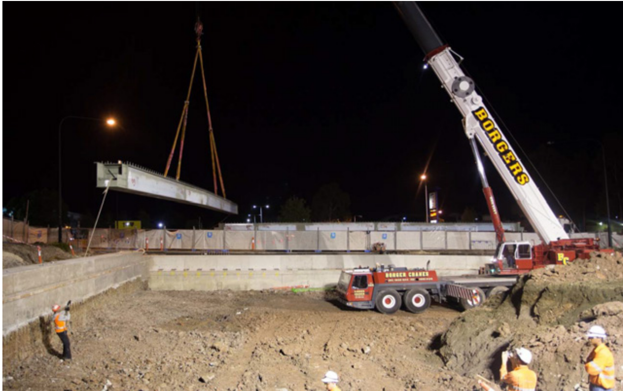
Figure 9 - Sydney Monorail Beams being re-used at the Norwest Station Site