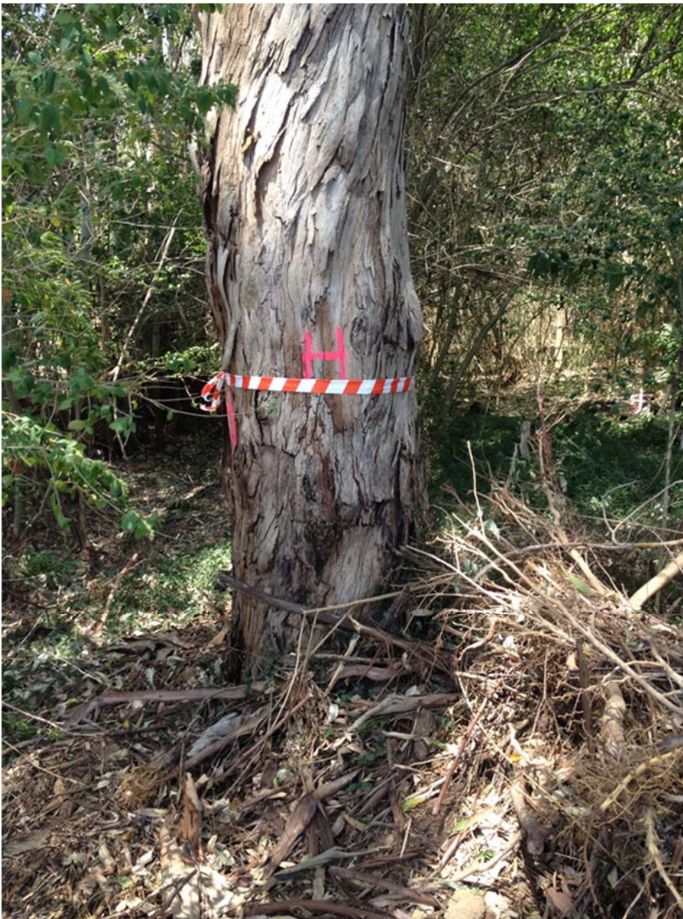
Figure 8 - Demarcation of Retained Flora