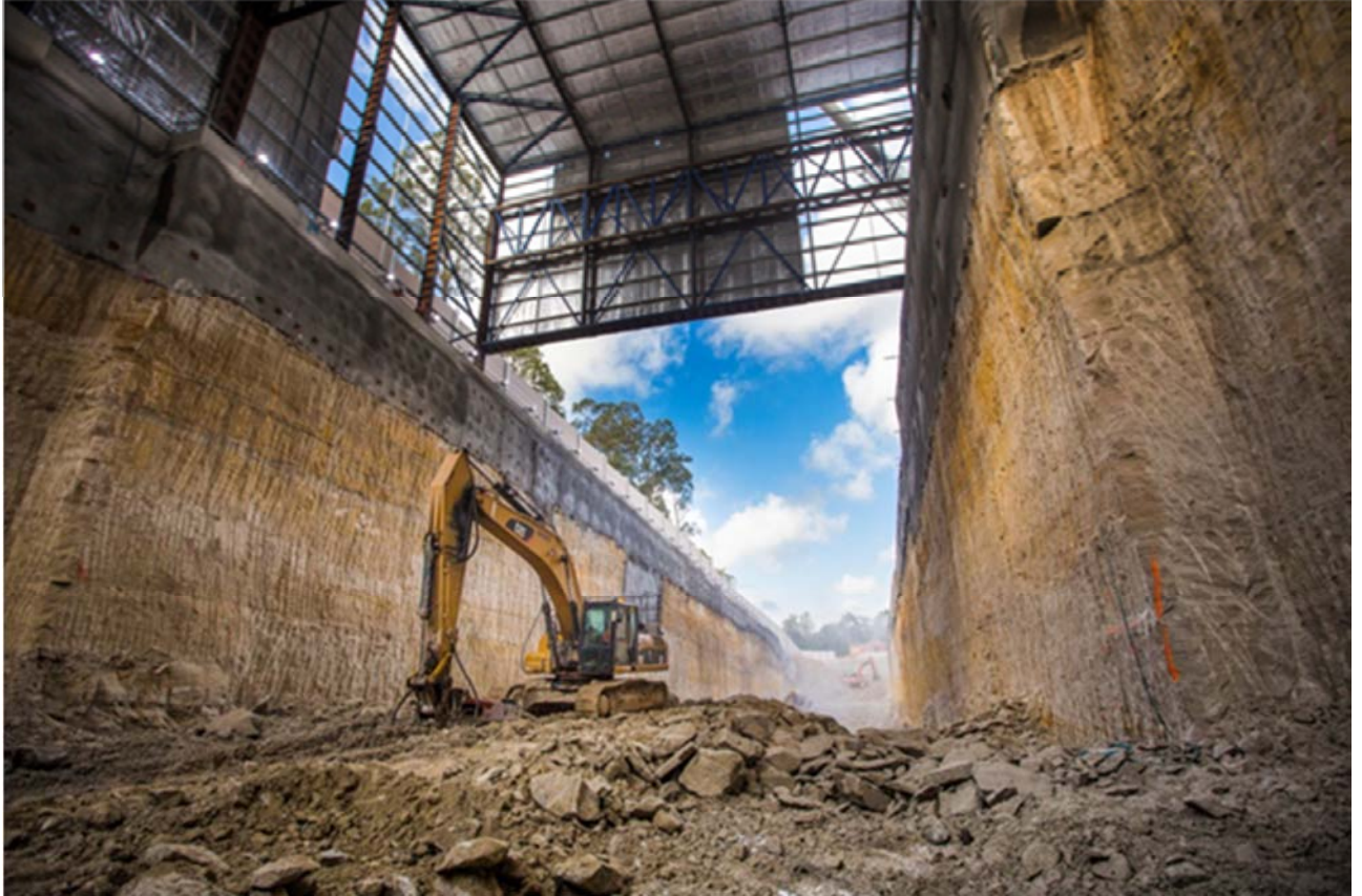
Figure 4 - Spoil and Excavation Works at the Showground Station Site