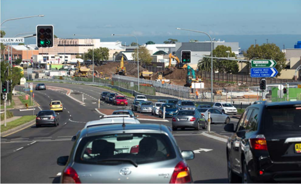
Figure 5 - Castle Hill Station Site at the Intersection of Old Northern Rd and McMullen Ave