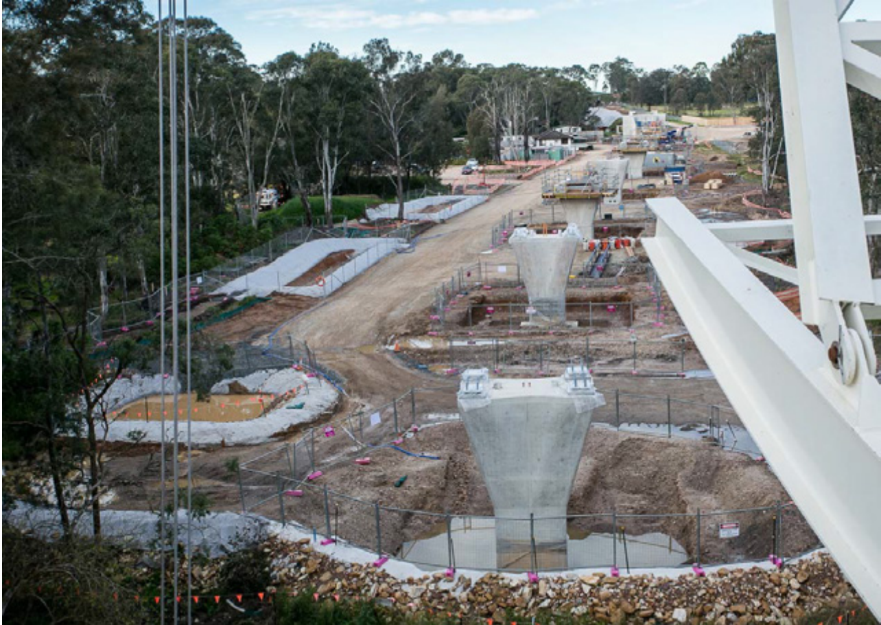
Figure 10 - Erosion and Sediment Controls at the Cudgegong Rd Site