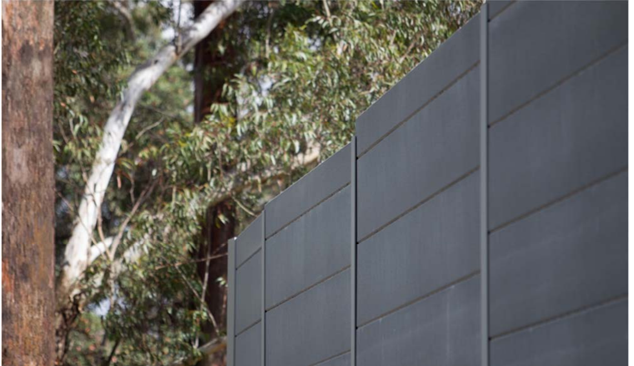
Figure 6 - Hebel Wall Noise Barrier at the Cheltenham Services Facility Site