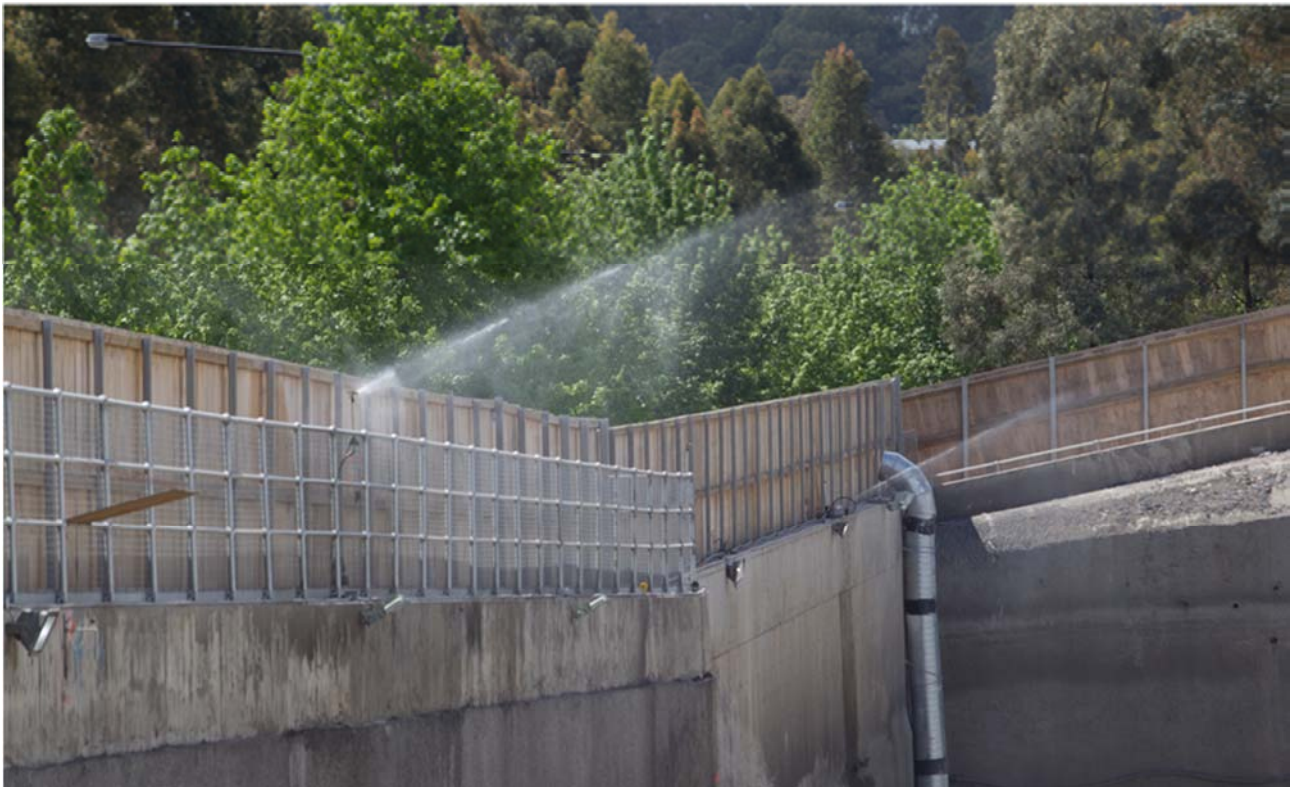
Figure 11 - Dust Mitigation at Norwest Station Site