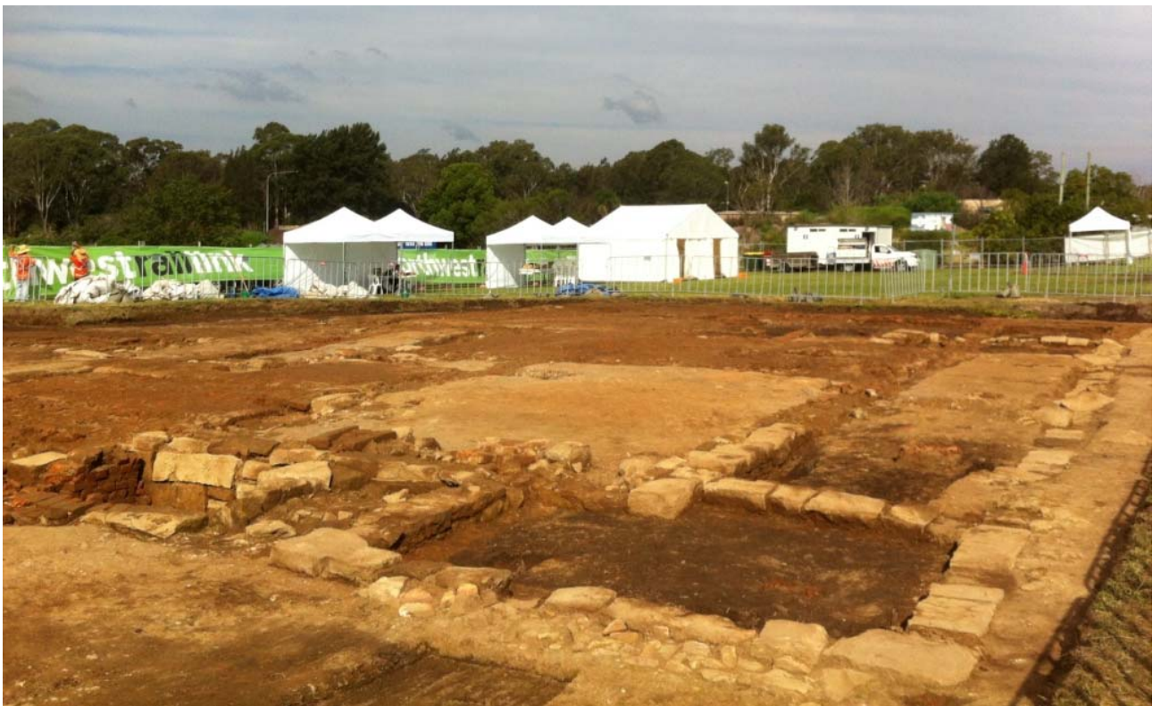
Figure 7 -White Hart Inn Excavation Site