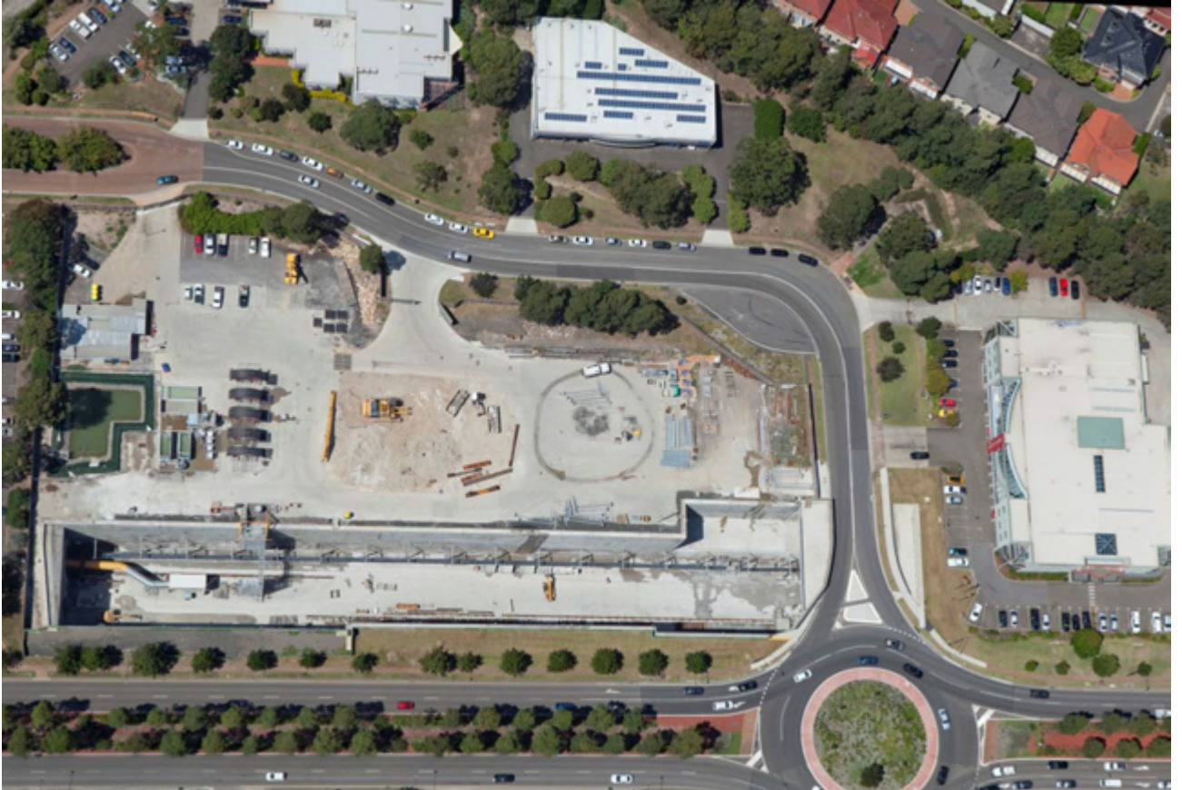
Figure 3 - Aerial View of the Sydney Metro Norwest Station Site