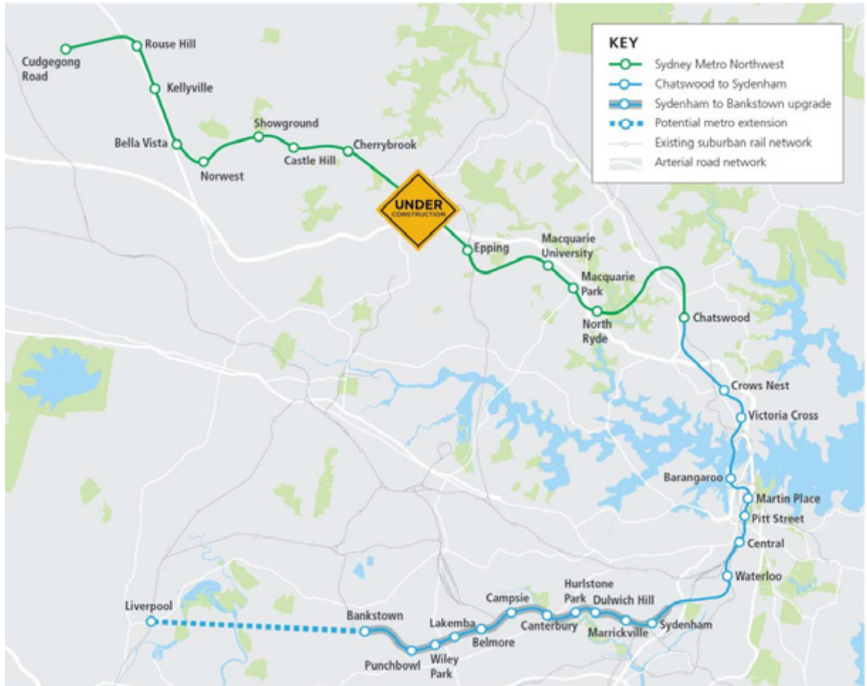
Figure 11 The Sydney Metro network