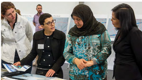
A Sydney Metro community event.