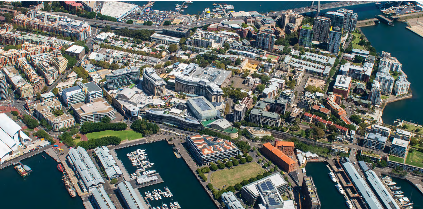
Aerial view of Pymont.