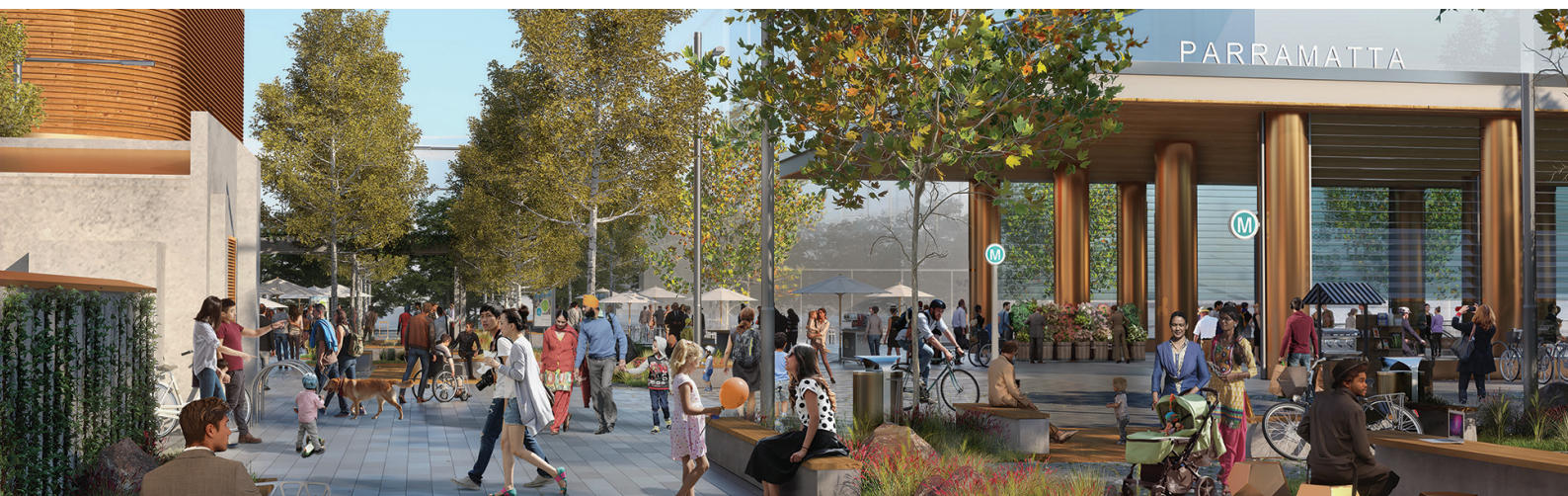
An artist's impression of Parramatta metro station.