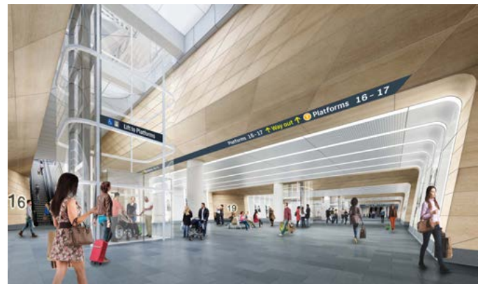
Artist's impression of the new Central Walk.

The excavation through layers of Ashfield Shale, Mittagong and Sydney Sandstone will eventually be 24 metres wide and 7 metres high.