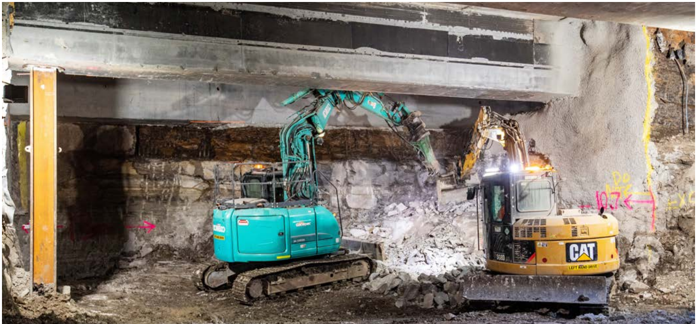
Central Walk excavation underway.

81 canopy tubes (horizontal piles) are being drilled under Chalmers Street to provide overhead ground support for future excavation works. 42 are being installed at the 20-28 Chalmers Street site and 35 are being drilled behind the hoarding on platforms 22-23.