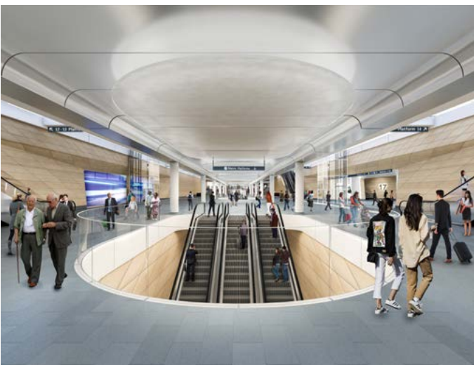
Artist's impression of the new North-South Concourse

The largest concrete pour to date to complete the new Concourse was 651.5m 3 . One floor down, three to go - the Metro Box team continues to excavate down 27 metres to the new metro tunnels, working around Devonshire Street Tunnel and down under the North-South Concourse to level B1 where critical back of house mechanical and electrical rooms will be constructed.