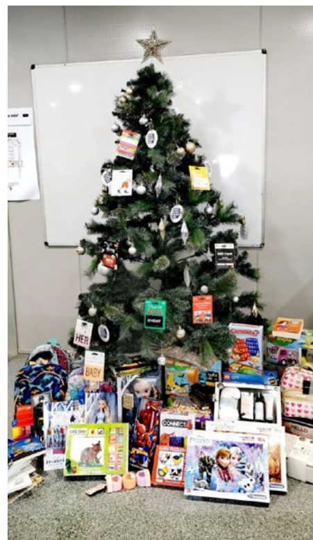
Presents and gift cards donated to the Women's and Girls' Emergency Centre.