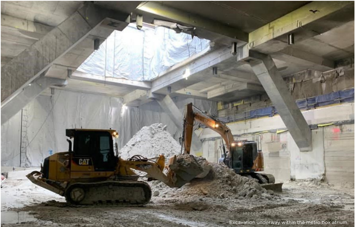
Excavation underway within the metro box atrium.