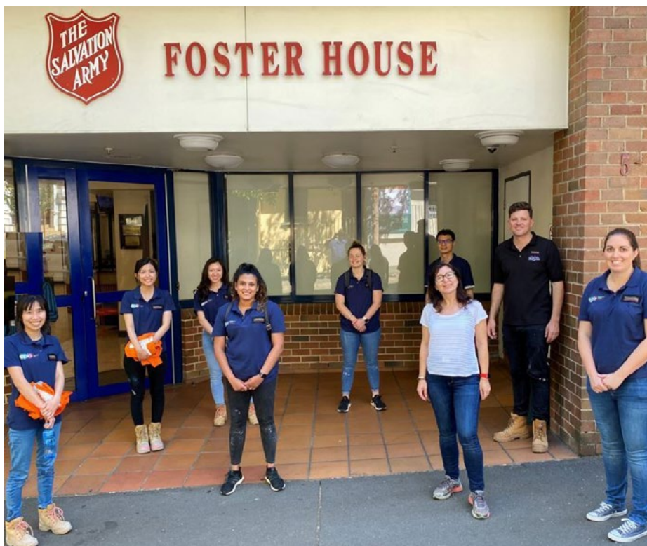
The painting team at Foster House.