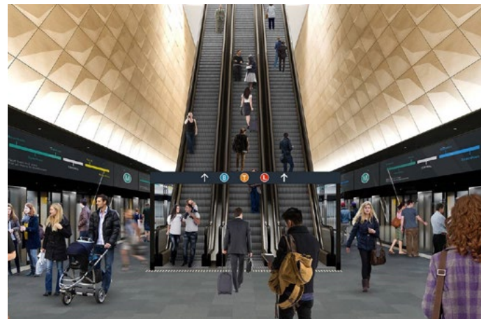
Artist's impression of the new metro station.

Throughout the rest of the metro box, a load transfer methodology was successfully completed, which will result in an open and column free space on the new metro platforms.