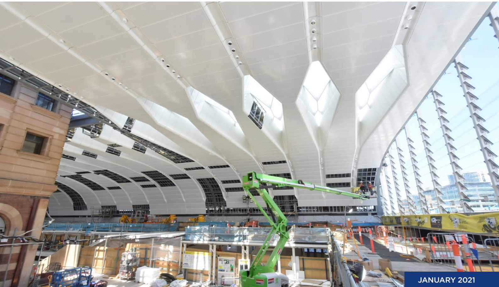
Construction of the new Northern Concourse roof at Central Station nearing completion.