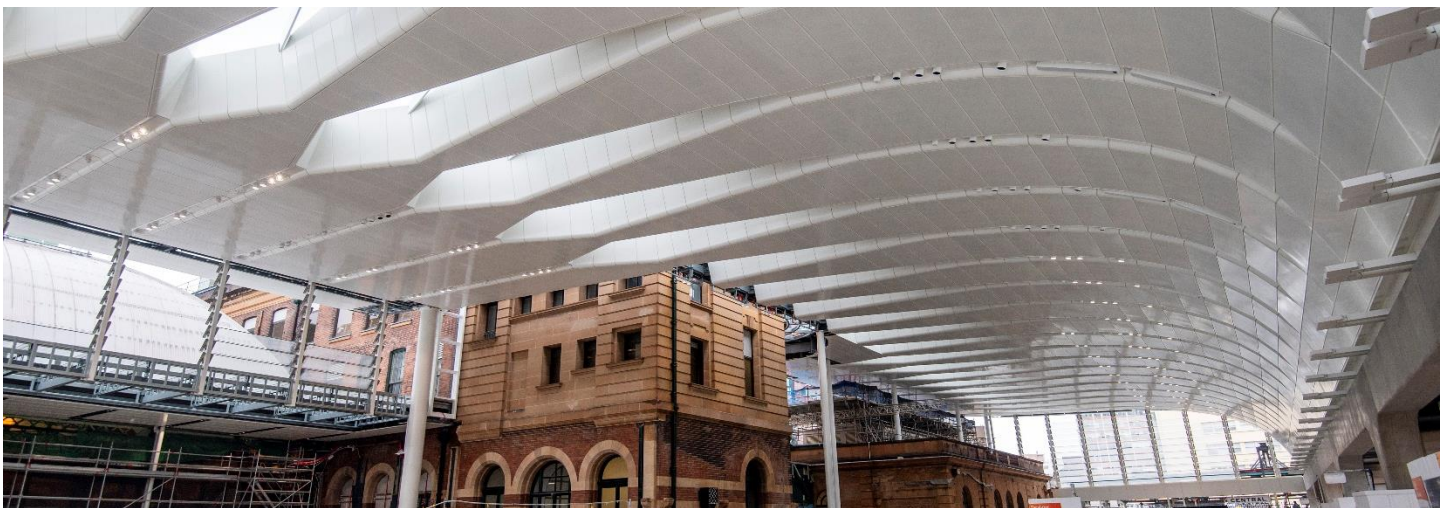
The new roof over the Northern Concourse