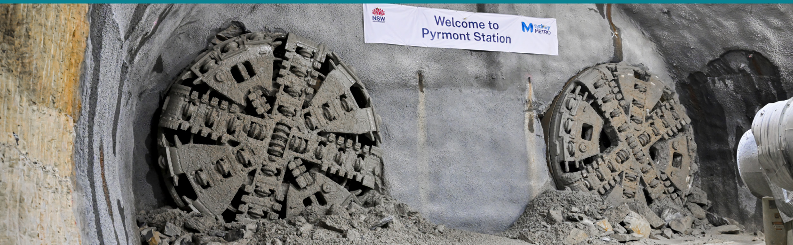
Tunnel boring machines (TBMs) Ruby and Jessie successfully broke through into the Pyrmont cavern in August.