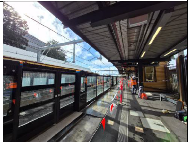
Figure 4 – Marrickville Station - Asphalt removal and majority of works completed at Marrickville Station.