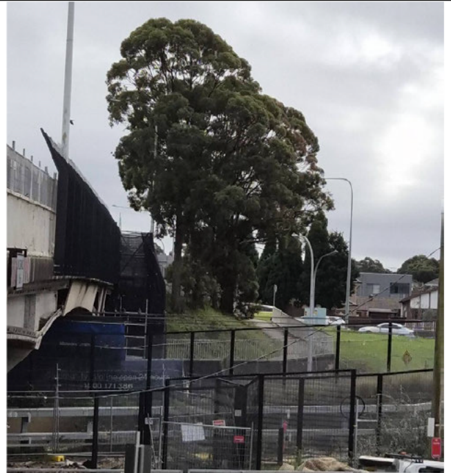
Figure 2 – Stacey St, Bankstown – Panel removal from Stacey St Overbridge ongoing.