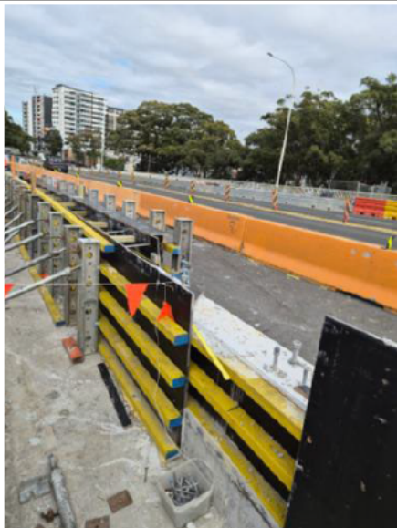
Figure 3 – Stacey St – Stage 2 – Hydro demolition of existing footpath and kerb complete, Footpath works including form, reo and pour (FRP) ongoing.