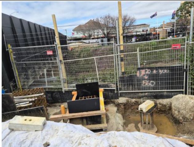
Figure 7 – Haldon St, Lakemba – Piling works completed. Form, reo, pour (FRP) works for over structure beam (OSB) ongoing.