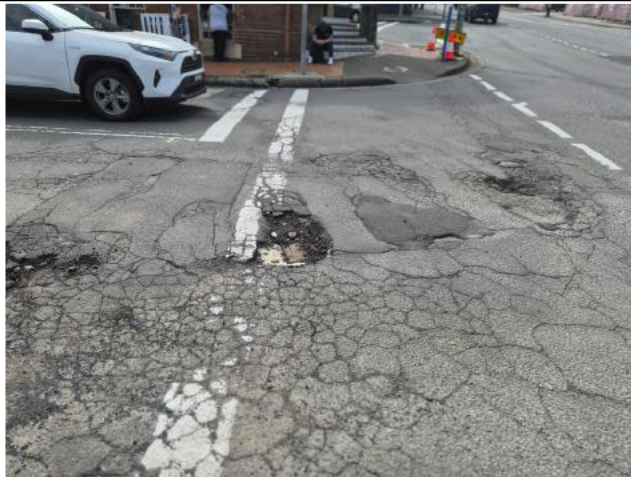
Figure 5 – Canterbury Rd, Canterbury - Bollards installed. Footpath and Sydney water asset relocation related investigation works ongoing. Unexpected finds identified during non-destructive excavation using vacuum truck. Area backfilled and heritage specialist is scheduled to attend site.