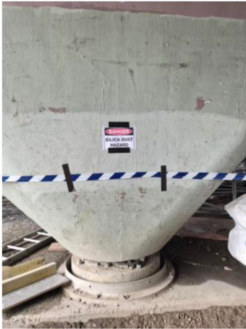
Figure 1 – Stacey St, Bankstown – Bridge modification works commenced.