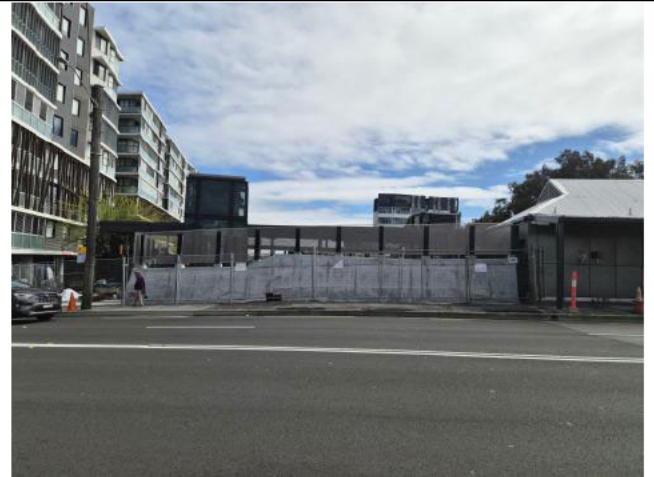
Figure 6 – Canterbury Road, Canterbury - Anti-throw screen installation completed on the station side.