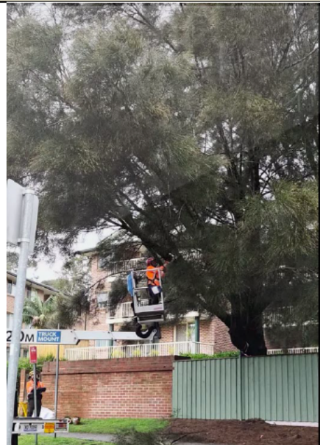
Figure 2 – Charles St – Tree trimming works being undertaken.