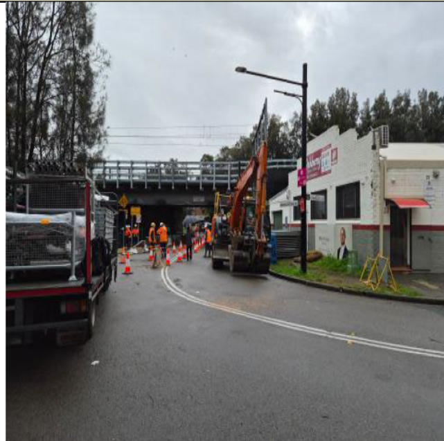
Figure 1 – Charles St – Traffic Management Plan/Traffic Control Plan Implementation completed at the Charles St crash beam installation site.