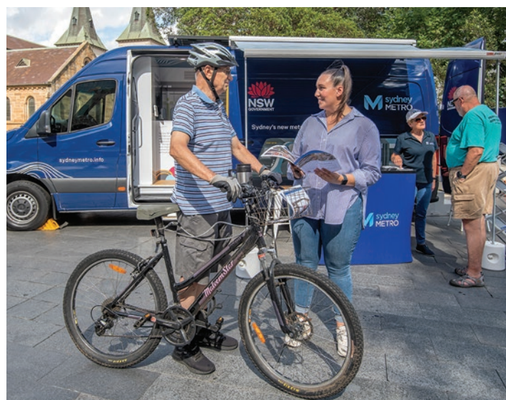
Sydney Metro's community engagement van, pictured here in Parramatta's Centenary Square.

You can contact our team via our 24/7 information line on 1800 612 173 or sydneymetrowest@transport.nsw.gov.au