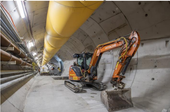
Image below was taken inside the tunnel and shows the progress of the cross-passage excavation

Excavation works has now commenced in the invert (tunnel base) with completion expected by early July.