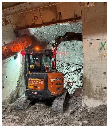
Image on the right was taken inside the tunnel and shows the progress of the cross-passage excavation

Excavation works will continue over the next week and is scheduled to be completed on Friday 13 June .