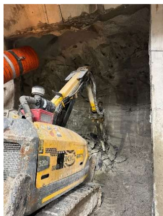
Image on the right was taken inside the tunnel during cross passage excavation works.

Excavation works will continue over the coming weeks and is expected to be completed in mid-June.