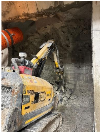
Image on the right was taken inside the tunnel during cross passage excavation works.

Excavation works will continue over the coming weeks and is expected to be completed in mid-June.