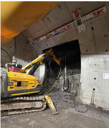
Image on the right shows the progress of the cross passage works and completion of the segment removal.

These works have been carried out in preparation for the excavation work which has commenced and will continue in the coming weeks.