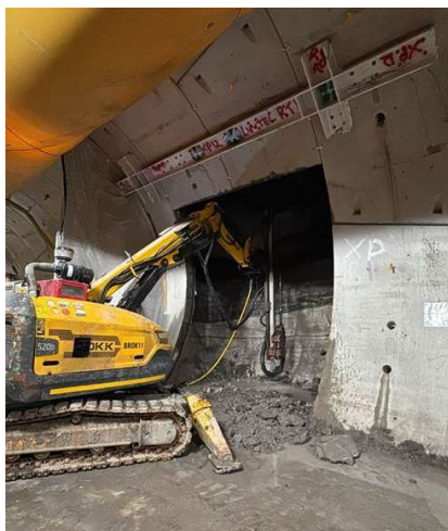
Image on the right shows the progress of the cross passage works and completion of the segment removal.

These works have been carried out in preparation for the excavation work which will commence next week.