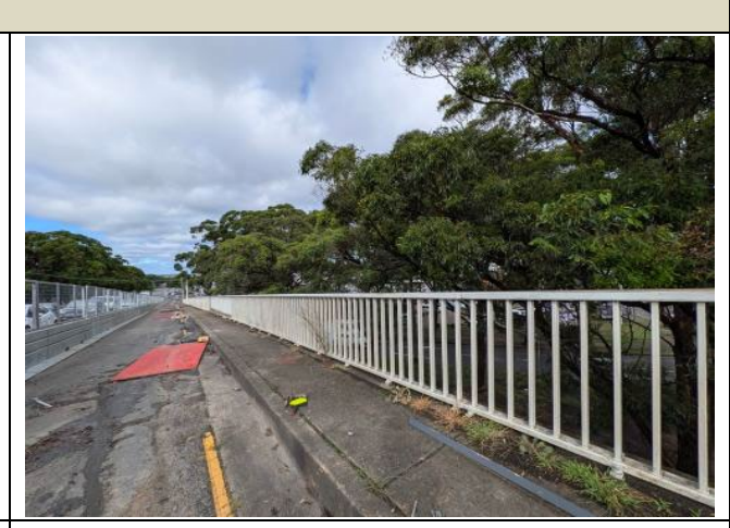
Figure 2 – Stacey St, Bankstown – Tree trimming required to support footpath widening activities, ecologist/arborist survey to be undertaken.

Figure 1 – Stacey St, Bankstown – Stage 2 of the hydro-demo works have been successfully completed. Site clean-up and footpath widening works in progress. Some tree branches pruning is required, arborist assessments underway.