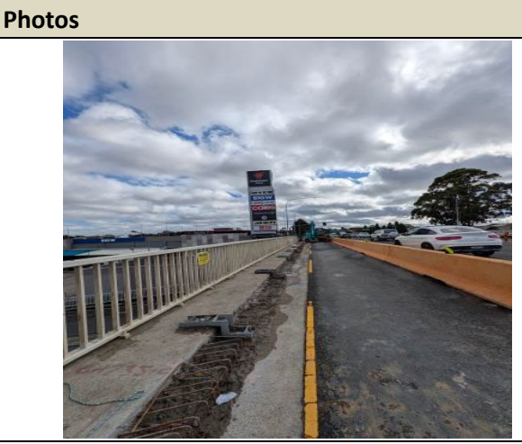
Figure 1 – Stacey St, Bankstown – Stage 2 of the hydro-demo works have been successfully completed. Site clean-up and footpath widening works in progress. Some tree branches pruning is required, arborist assessments underway.