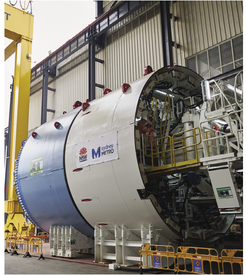
Tunnel boring machine being Factory Acceptance Tested.