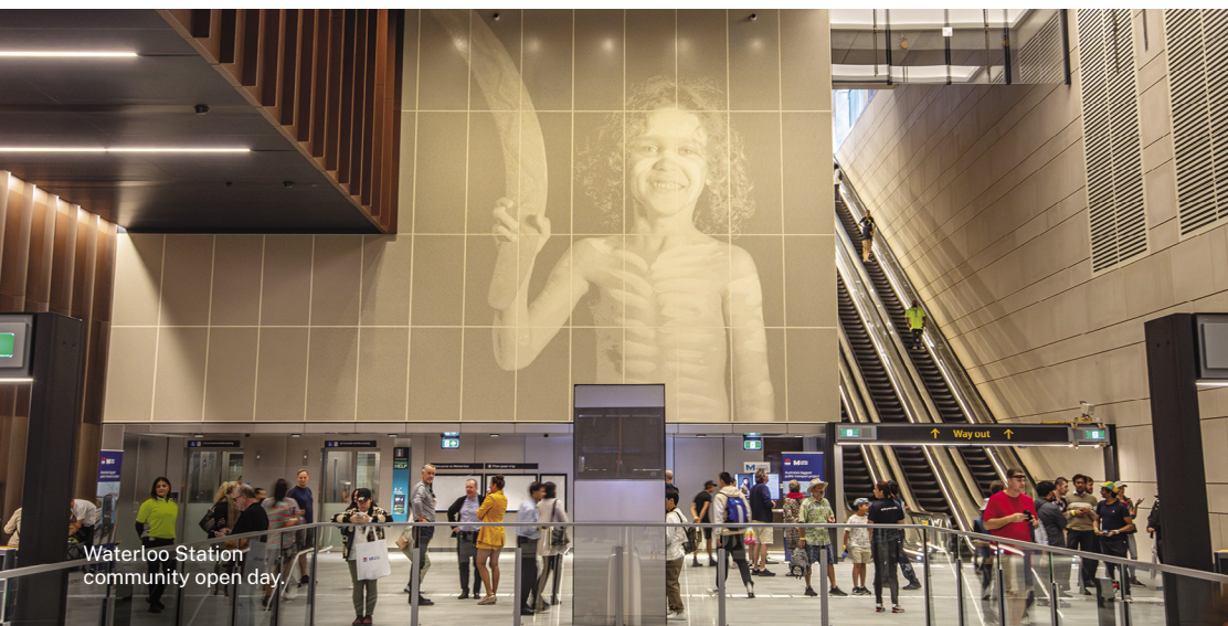
Waterloo Station community open day.