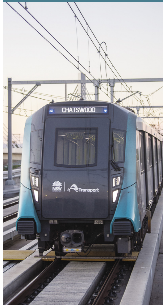
Sydney Metro's Northwest metro train.