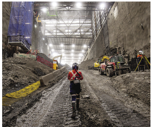
Excavation works inside the station box at Westmead Metro Station site.

To get more tips on design thinking, go to sydneymetro.info/metro-minds-steam-challenge