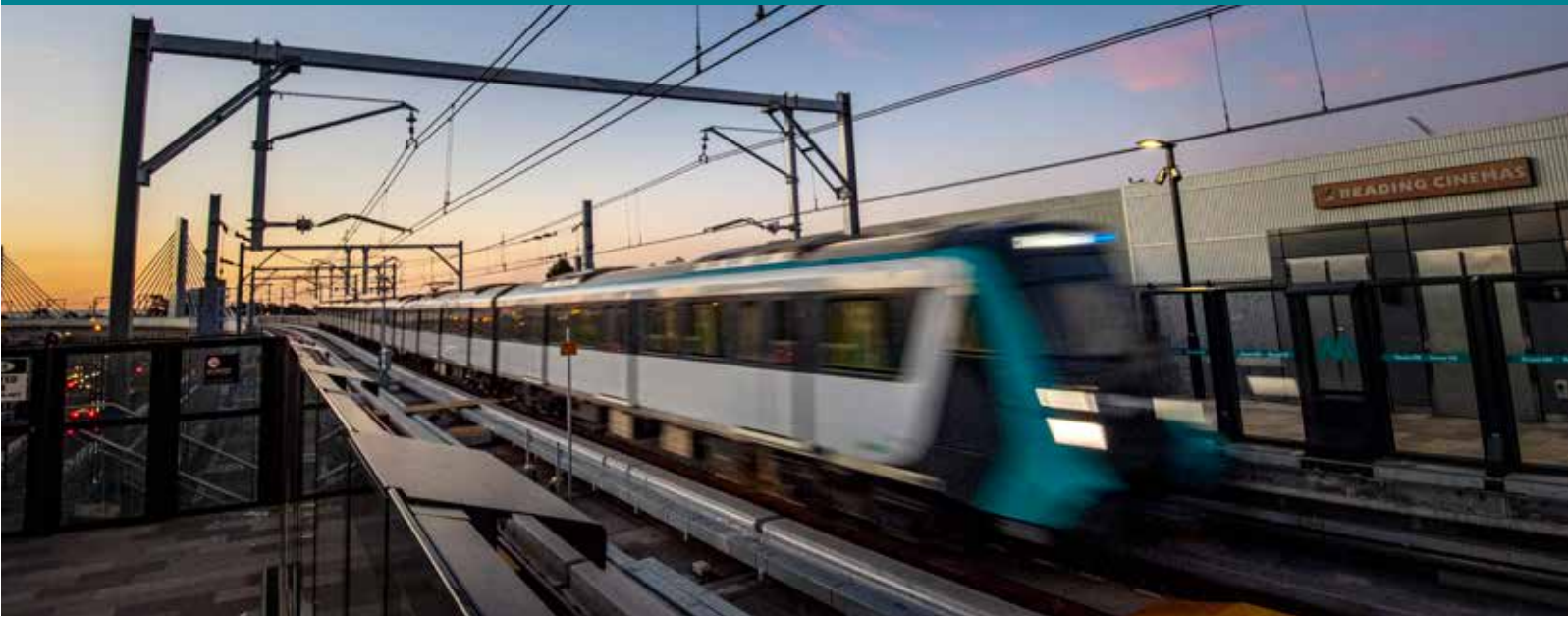
A Sydney Metro train on the Northwest line.

The NSW Government is delivering Sydney Metro West – a new underground metro railway which will double rail capacity between Parramatta and the Sydney CBD, transforming Sydney for generations to come. This once-in-a-century infrastructure investment will provide fast, reliable turn-up-and-go metro services with fully accessible stations, link new communities to rail services and support employment growth and housing supply. The project is expected to create about 10,000 direct and 70,000 indirect jobs during construction. Stations have been confirmed at Westmead, Parramatta, Sydney Olympic Park, North Strathfield, Burwood North, Five Dock, The Bays, Pyrmont and Hunter Street in the Sydney CBD. Two potential station locations are being investigated west of Sydney Olympic Park, including one at Rosehill Gardens which could support a significant increase in housing. Sydney Metro West will target an opening date of 2032.