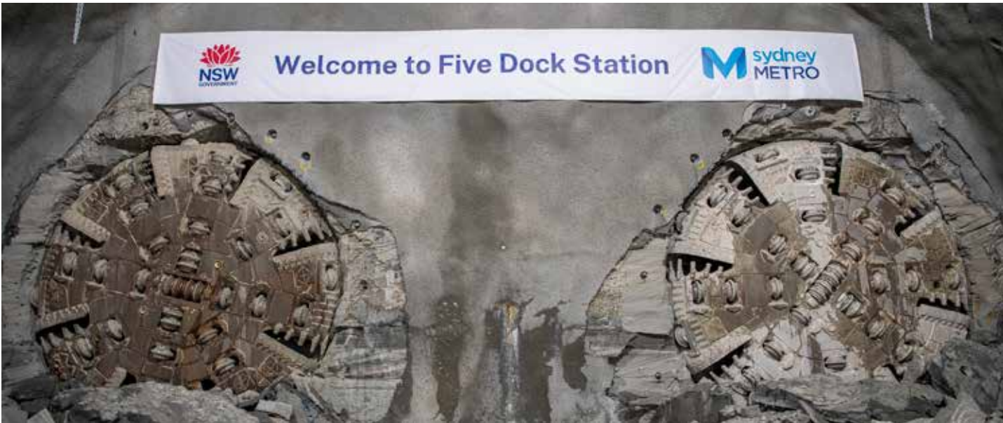
Two tunnel boring machines (TBMs) have achieved a double breakthrough at Five Dock Station.

Six tunnel boring machines (TBMs) will carve out the 24-kilometre Sydney Metro West line between Sydney CBD and Westmead. Four TBMs have already started their journey commencing major tunnelling for Sydney Metro West.