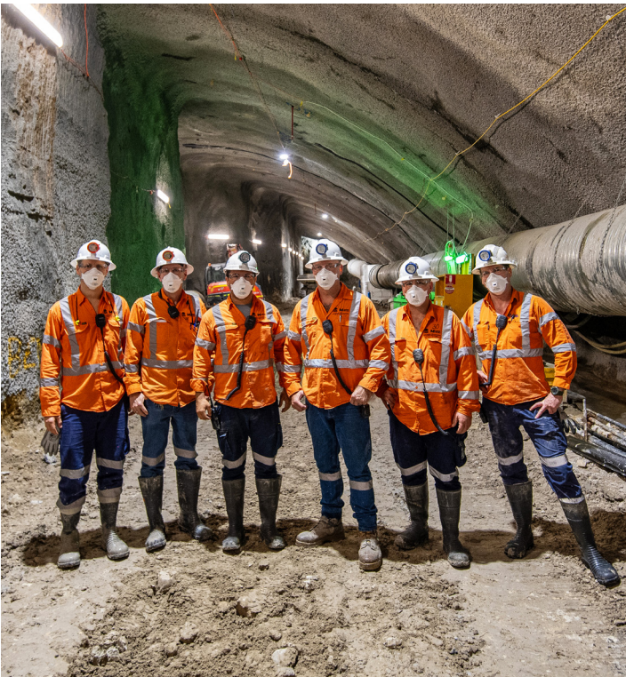
The first heading in the Hunter Street Station cavern has been excavated.

The final stage is the invert, which involves cutting the floor of the cavern. This requires trimming of the curved tunnel floor with a roadheader to the full width of the cavern. The invert will be completed in late 2024.