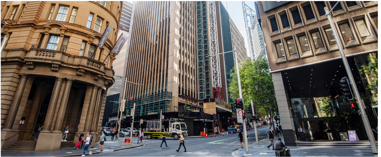
The current view of the Hunter Street West site, looking from the corner of Pitt Street and Hunter Street.