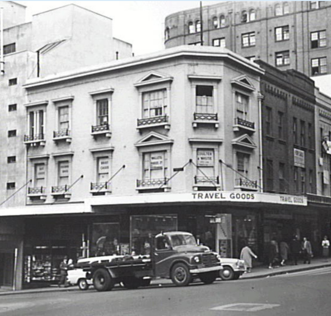
The former Skinners Family Hotel building stopped functioning as a hotel in the late 1800s and was a travel goods shop at the time this photo was taken in 1962. (Source: City of Sydney Archives–George Street Sydney–15/08/1962).

Thorough planning and delicate construction work will ensure this historic building is preserved and can be incorporated into the future over station development of Hunter Street Station.