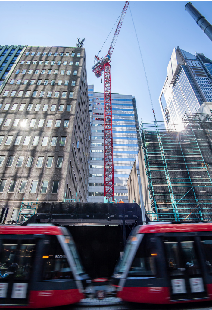
Two tower cranes are facilitating demolition works at Hunter Street.

Hoarding has been installed around both sites and two tower cranes are supporting demolition works, while scaffolding is due to be installed to full height by the end of this year.