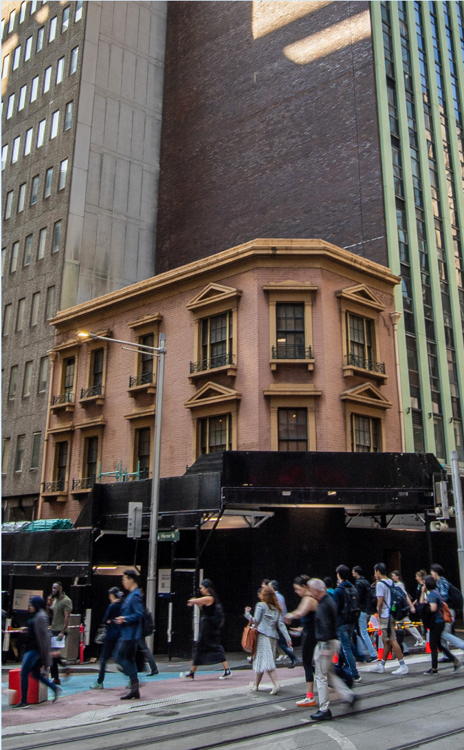
The current view of the heritage building at the Hunter Street West site.