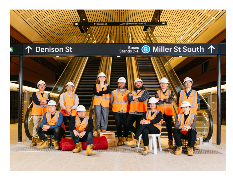
Victoria Cross food and beverage retailer owners.

Victoria Cross Station and the surrounding precinct will be the catalyst for North Sydney's revitalisation, combining new commercial workplaces and retail offerings, delivering a resurgence of energy and foot traffic through the lively laneways, notable landmarks and reimagined public spaces, for all to enjoy.