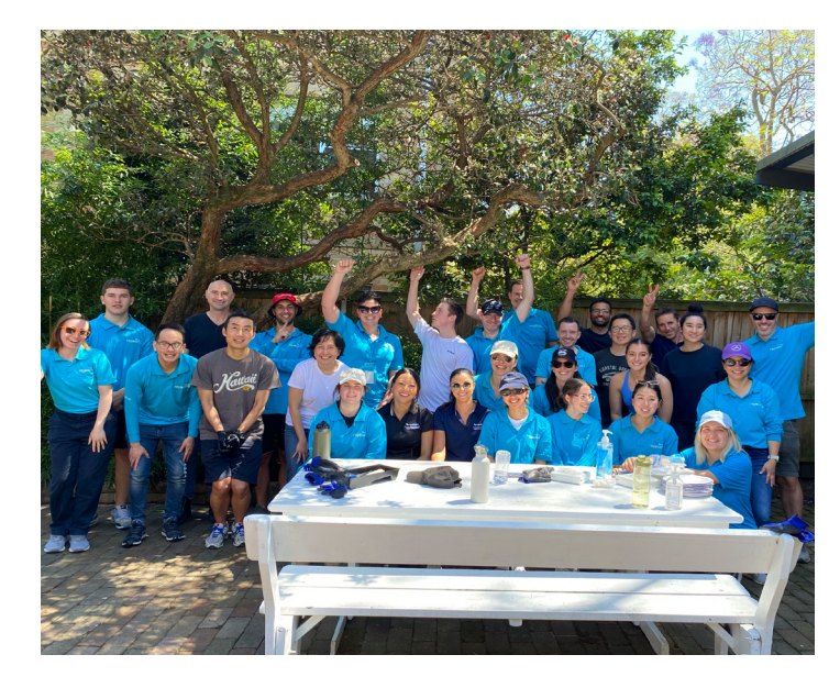
Victoria Cross project team.

It was not only a day of transformation for the shelter but also a milestone in the ongoing commitment to community welfare and sustained collaboration between Lendlease and Taldumande over the course of the project.