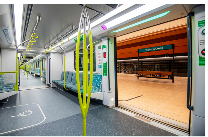
Train testing at Victoria Cross Station.