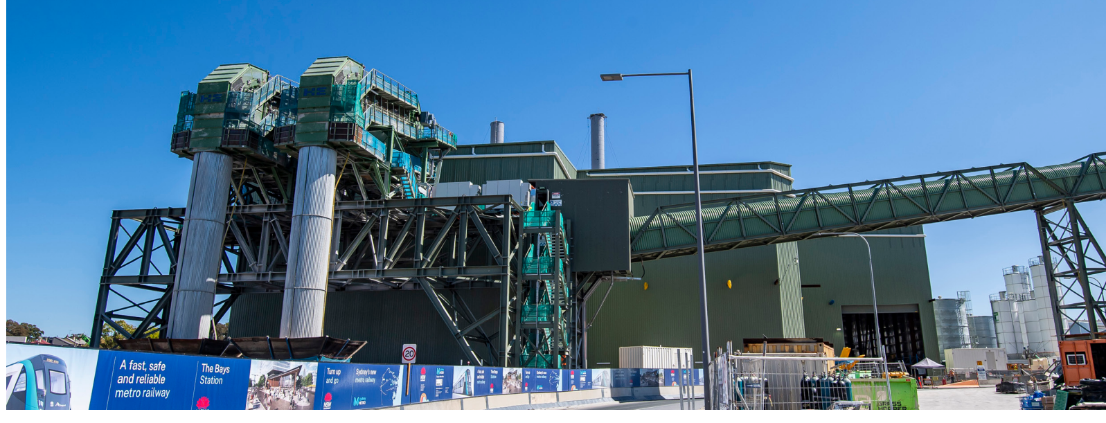
Vertical conveyors at The Bays Station site.

To follow the progress of the Sydney Metro West tunnel boring machines visit sydneymetro.info/sydney-metro/journey-sydney-metro-west-tunnel-boring-machines