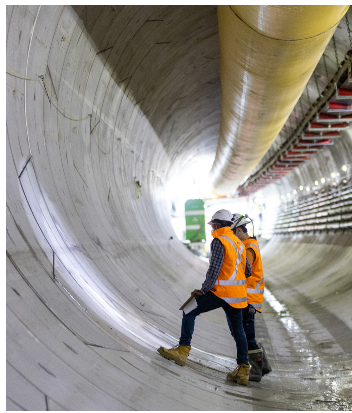
Quality assessments taking place inside the tunnel.

Over 70,000 concrete segments will be used to line the twin tunnels between The Bays and Sydney Olympic Park. The segments are being made at a purpose-built facility at Eastern Creek.