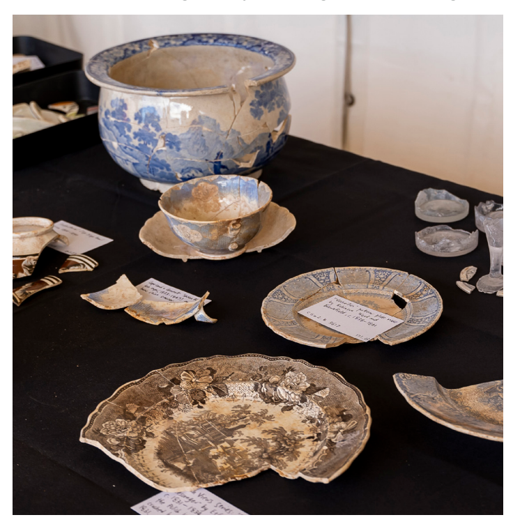
Dinner Time! Dining tables in 19th century Parramatta often showcased tableware made in Staffordshire, England, reflecting the global influence of British pottery during that era.