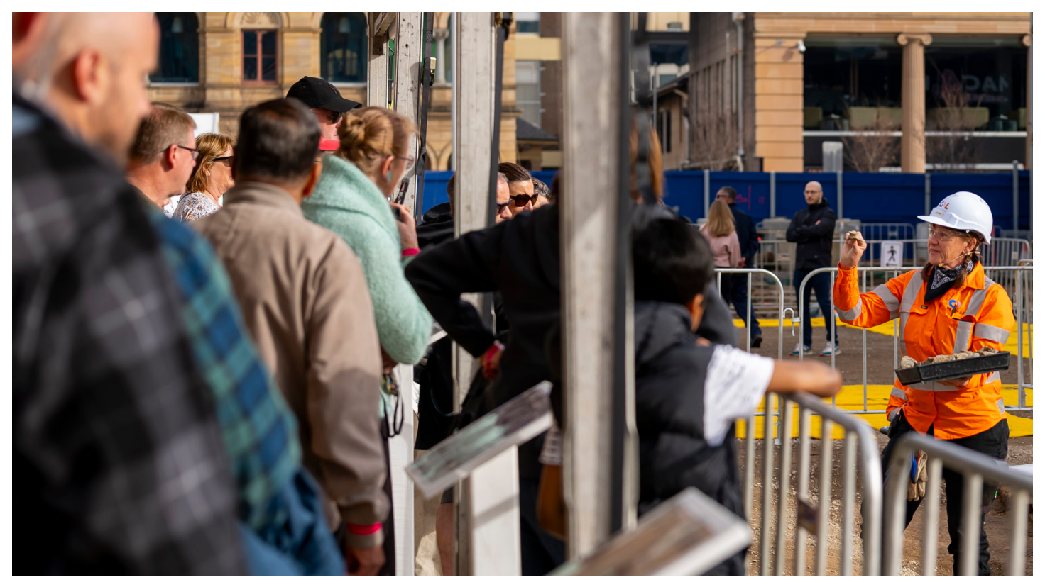
Sydney Metro's archaeology team has uncovered a wealth of history during investigations at Sydney Metro's Parramatta station site.

Parramatta is a place of extraordinary history and diversity. Heritage investigations at Parramatta metro station site can provide new insights and understanding of Parramatta's importance to First Nations people, early colonial settlement and adaptation to a new environment, daily life and urbanisation during the 19th century, and the evolution of the township of Parramatta into the city it is today.