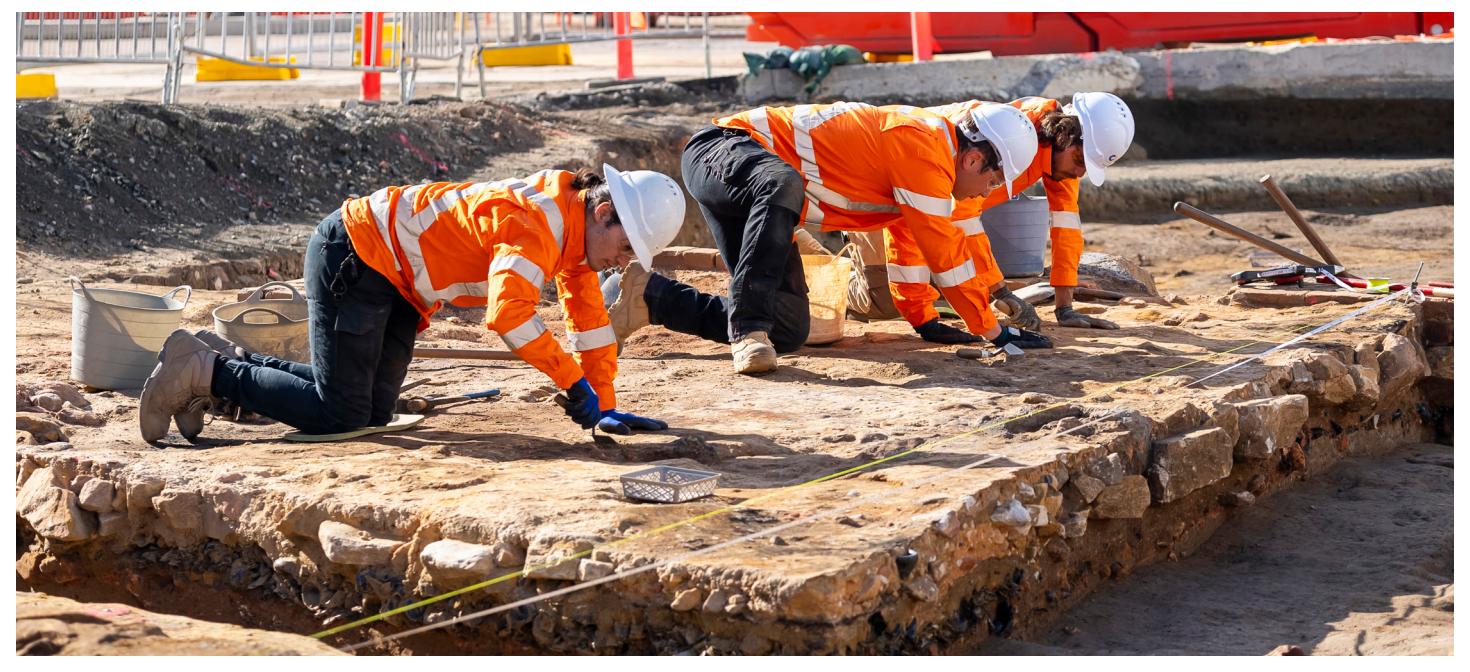
Hard at work: Archaeologists busy excavating on site uncovering artefacts that tell us more about the history of Parramatta.