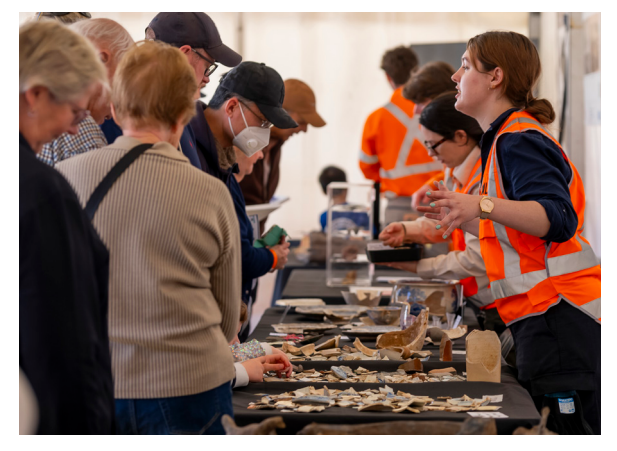
Sydney Metro's archaeology team spoke with the community about the archaeological investigations taking place at Parramatta at the Heritage Day.