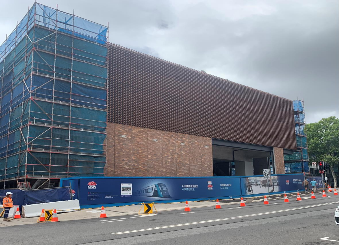
Figure 2 - Exterior works are progressing around the station buildings