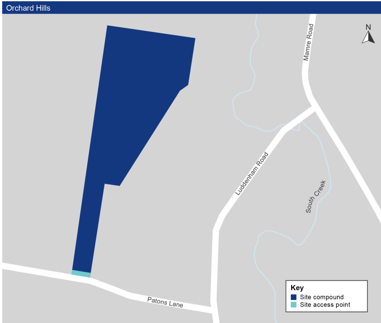
Map 2: Stabling and Maintenance Facility site