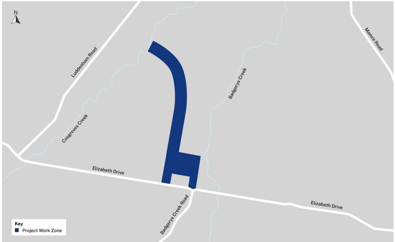
Map 3: Badgerys Creek section of the alignment