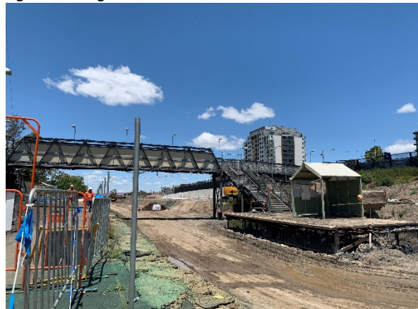
Figure 4.6: Heritage Bridge still in place