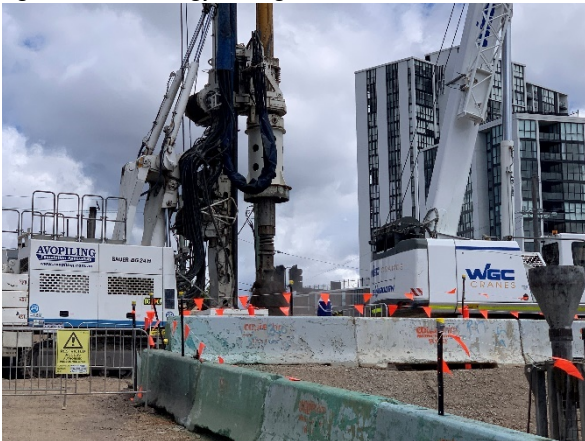
Figure 4.3: Piling for station box at Westmead