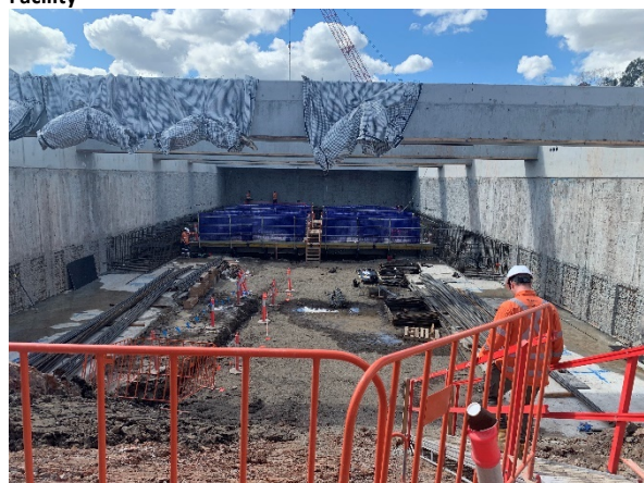
Figure 4.12: TBM launch box excavation