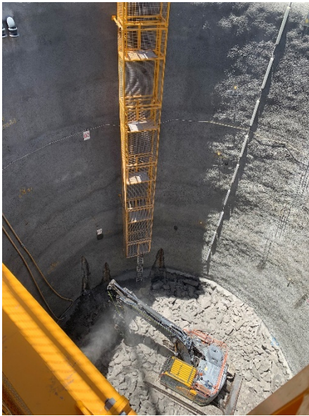
Figure 4.7: Shaft excavation at Clyde Dive