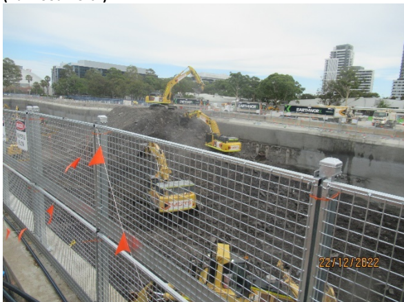
Figure 2 6 Ongoing excavation of the station box (SOP) using dozers and excavators