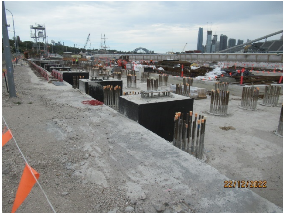
Figure 2 1 Ongoing large concrete pours for the Spoil shed foundations (The Bays)