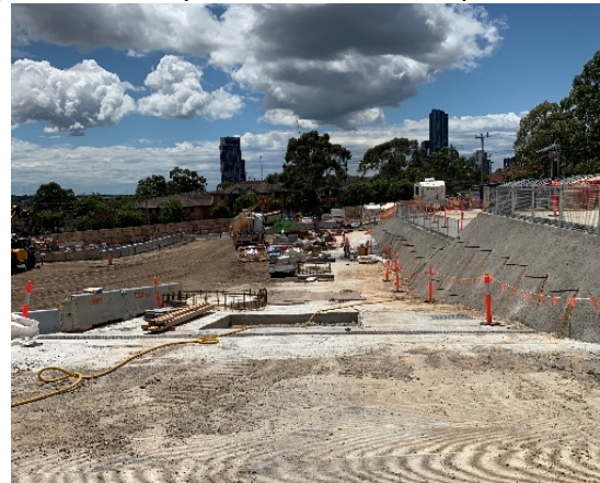
Figure 4.4: Long term Haul Road Westmead