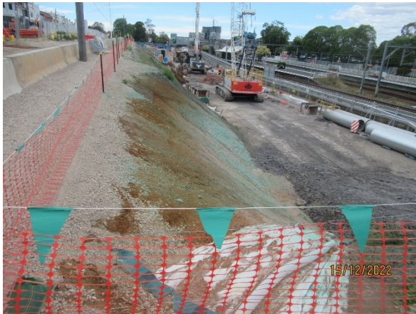
Figure 2-7 Ongoing piling on the lower side of the station box at North Strathfield