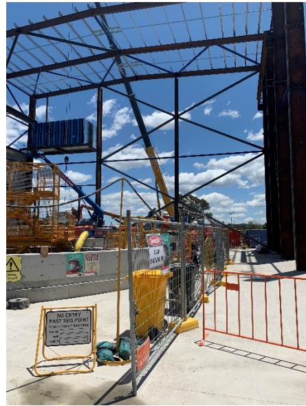
Figure 4.8: Acoustic Shed construction at Clyde Dive