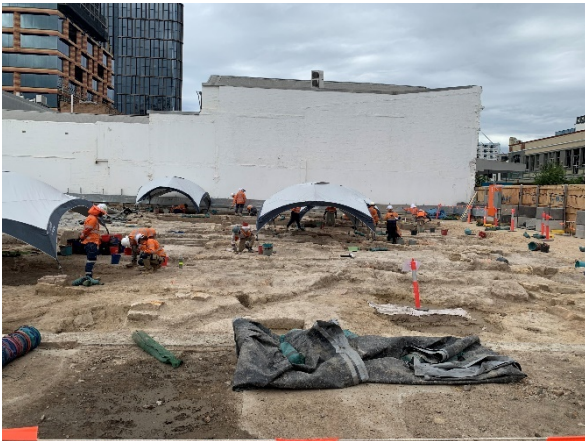
Figure 4.1: Archaeology investigations at Parramatta