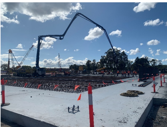
Figure 4.11: Spoil shed concrete slab construction at Rosehill