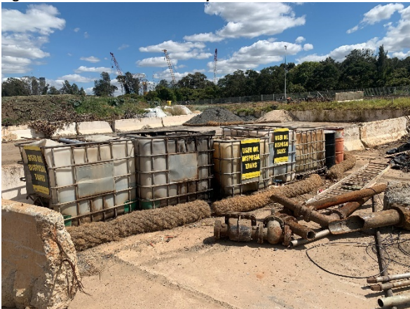
Figure 4.9: Chemicals from Speedway demolition