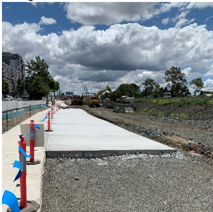
Figure 4.5: Long term Haul Road Clyde Dive