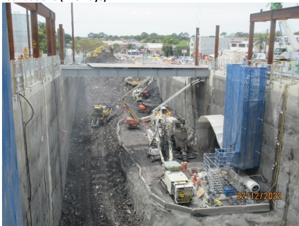
Figure 2 3 Ongoing excavation of the station box (Burwood North). Ongoing tunnelling in the adit.