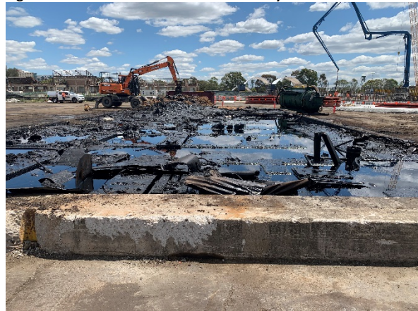
Figure 4.10: Bund under removed hydrocarbon silos at Downer Facility