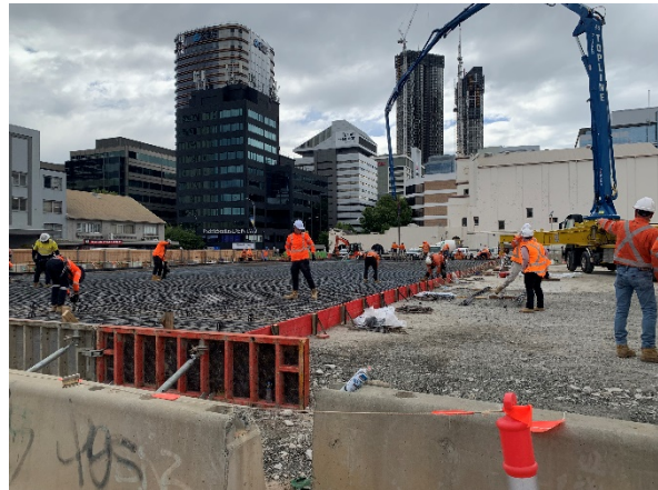
Figure 4.2: Bentonite platform and bund concrete pour