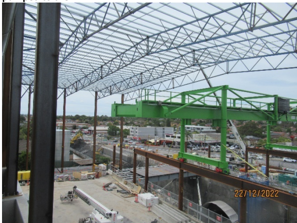
Figure 2 4 Ongoing construction of frame of the acoustic shed (Burwood North)