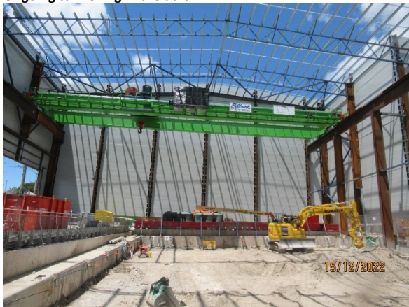
Figure 2 5 Ongoing construction of the acoustic shed (Five Dock-east). Roof sheeting still to be installed. Anchor installation for capping beam and commencement of excavation..