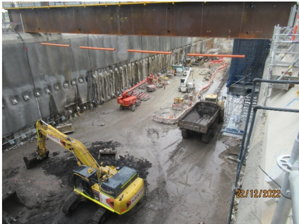
Figure 2 2 Ongoing excavation of the station box (The Bays). Water pumped to the WTP.