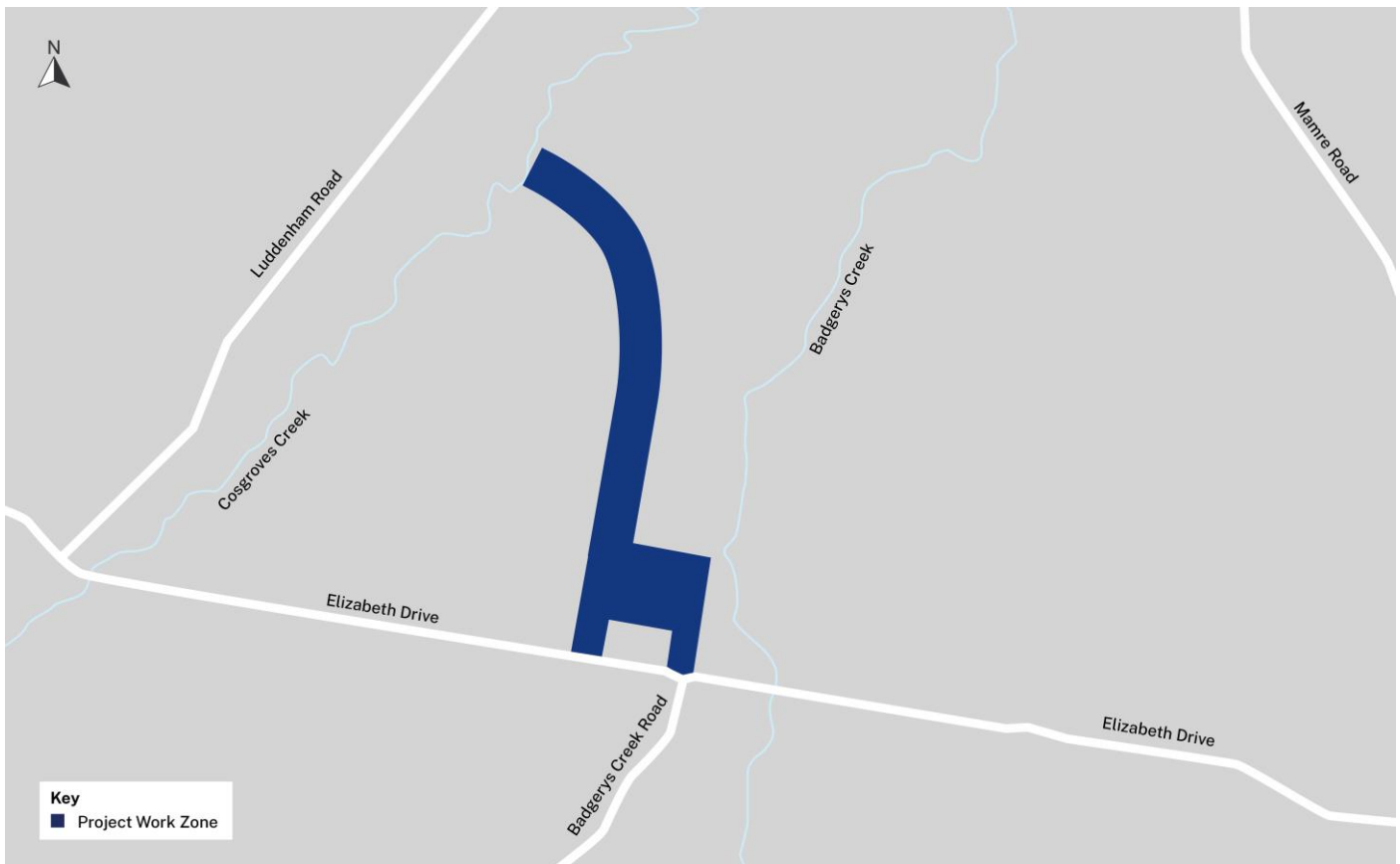
Map 3: Badgerys Creek section of the alignment