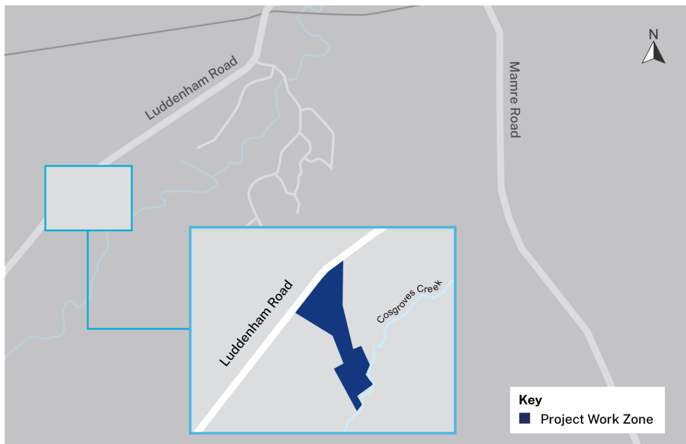
Map 2: Luddenham South section of the alignment