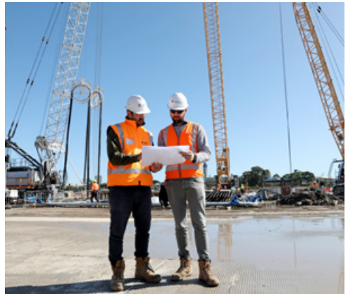
Sydney Metro's site at Rosehill.