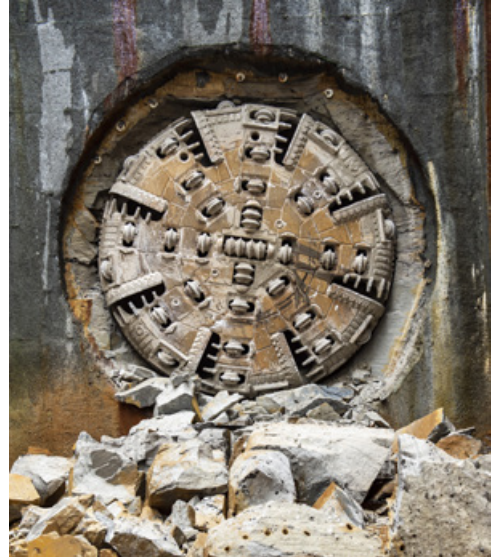
Tunnel Boring Machine (TBM) Mum Shirl Barangaroo breakthrough.