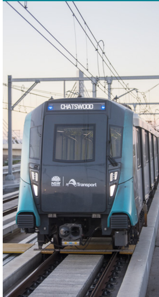
Sydney Metro's Northwest metro train.