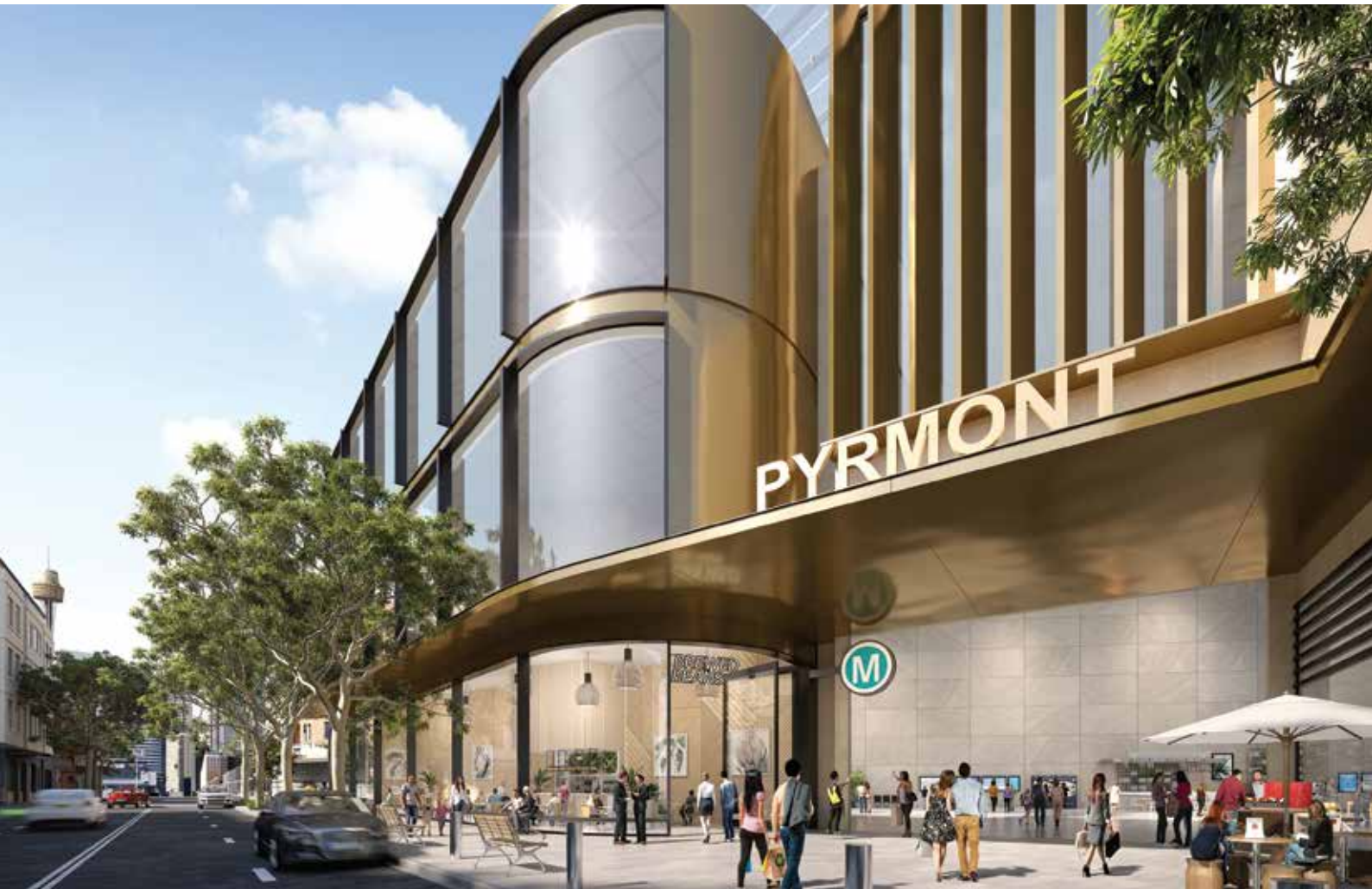
An artist's impression of Pyrmont Station.