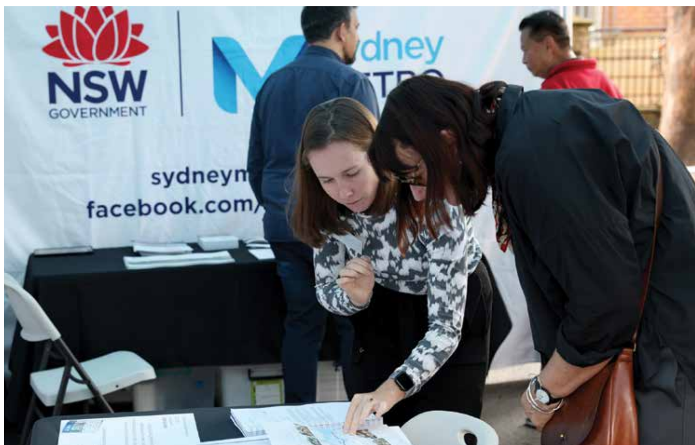
Community engagement at Rozelle Markets for Sydney Metro West.

Feedback from these planning processes has informed early planning for the Pymont over station development.