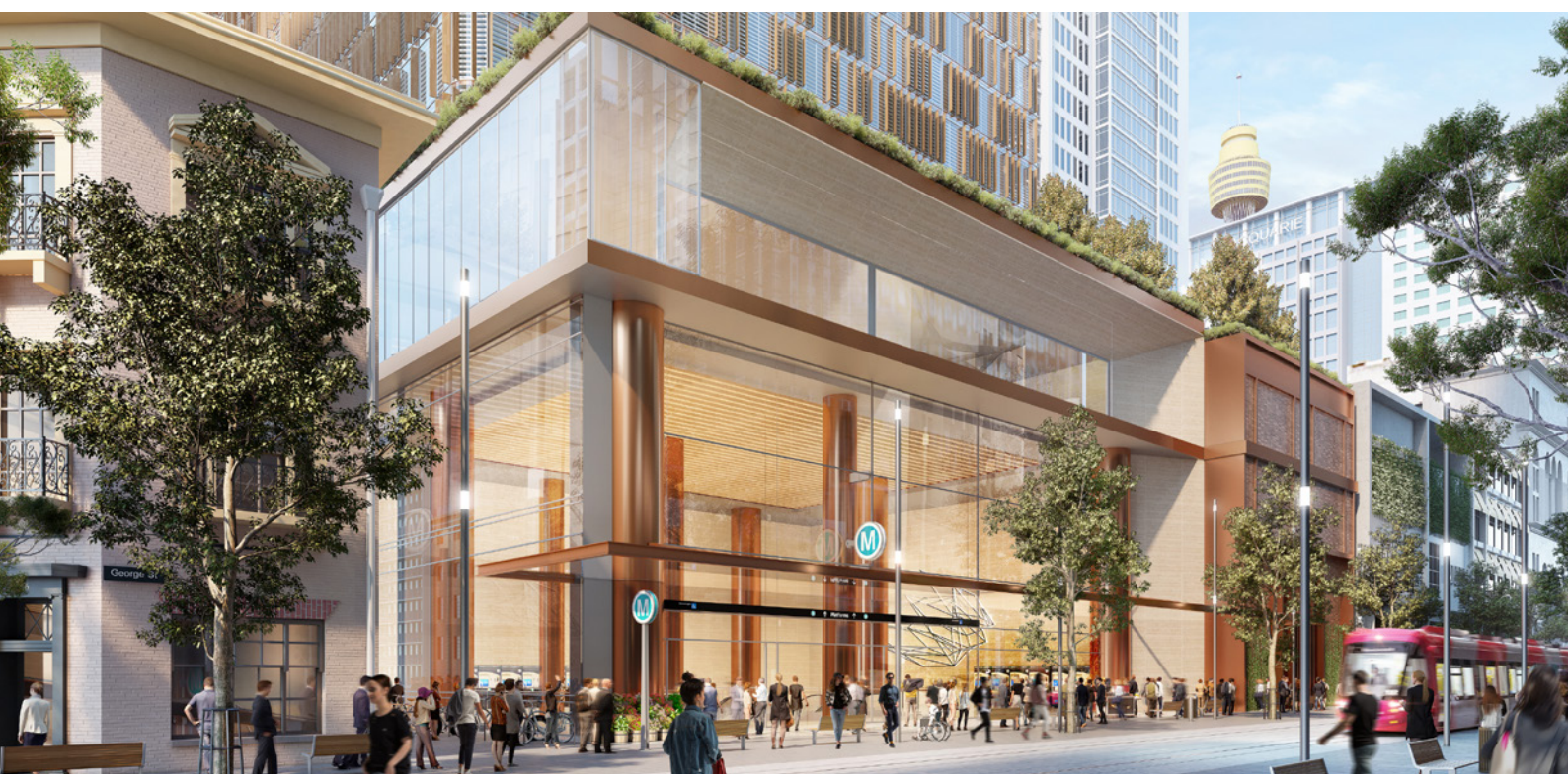
An artist's impression of Hunter Street metro station.