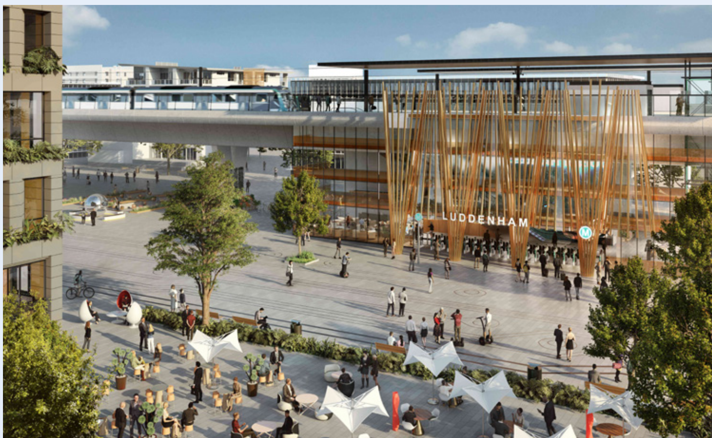
An artist's impression of Luddenham Station.