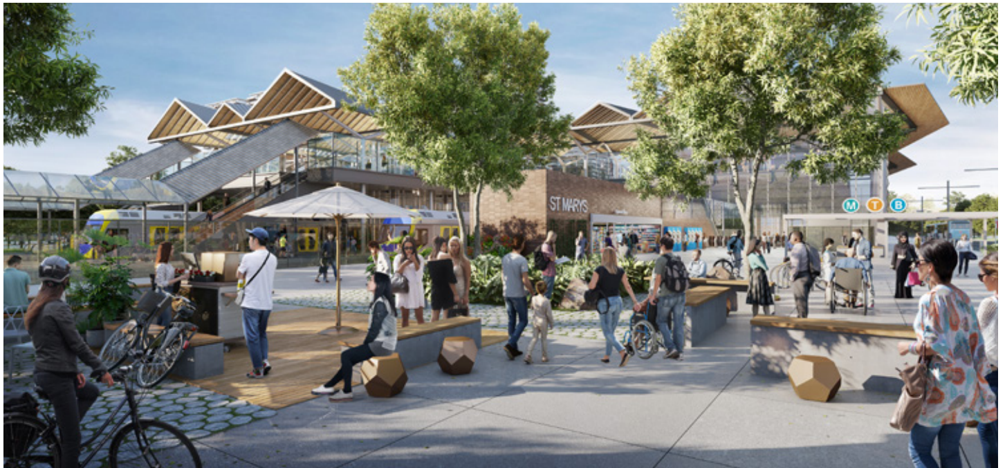
An artist's impression of St Marys Station.

The community will be seeing increasing levels of activity from Sydney Metro's contractors as work on this city-shaping project ramps up.