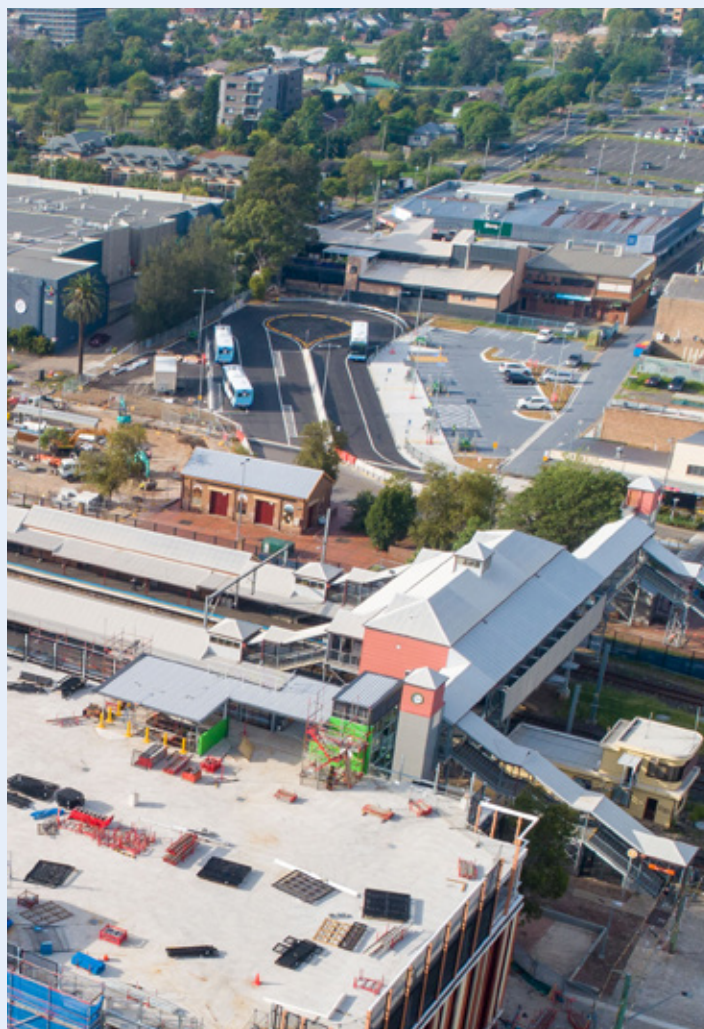
The St Marys temporary bus interchange, which opened in March 2022.

Power supply work in Claremont Meadows, Orchard Hills, Bringelly and Kemps Creek is progressing well with the installation of new cables and conduits between existing substations and new power kiosks. These works will provide a dedicated power supply source for the tunnel boring machines, other heavy machinery and construction sites needed to build the project. Power supply work commenced in early 2022 and is expected to be completed by the end of the year.