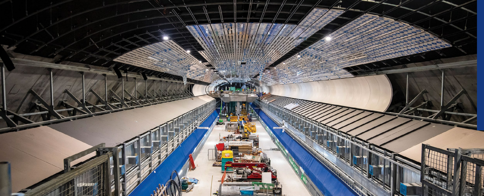
Victoria Cross cavern platforms in place.