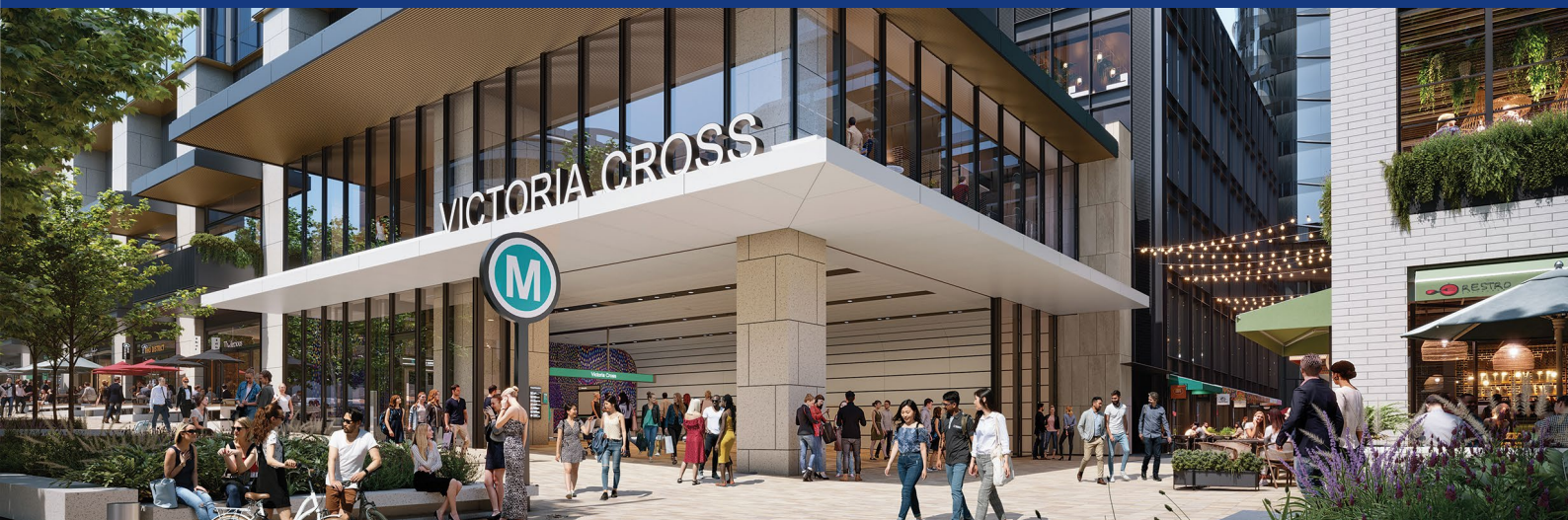
An artist's impression of the Victoria Cross Station entrance from Miller Street.