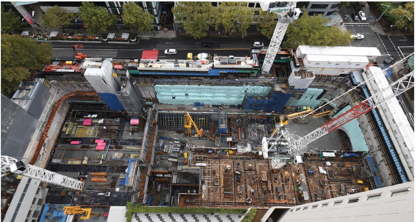
Overview of Victoria Cross South site on the corner of Miller and Berry streets.

It is essential that Sydney Metro proceed with these additional work hours. Without the additional working hours, Sydney Metro will remain on site completing works for an overall longer period of time.