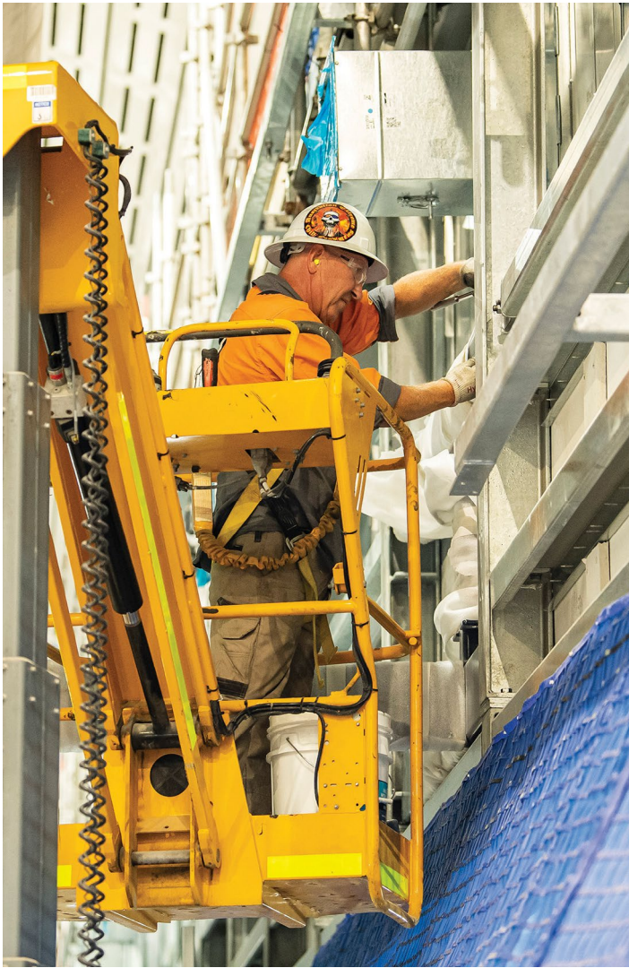
Construction works inside the cavern at Victoria Cross Station.