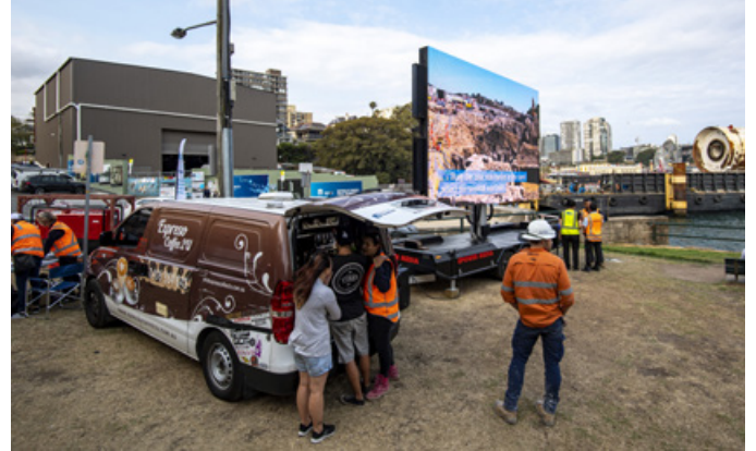
Community event for the Tunnel Boring Machine (TBM) Mabel breakthrough.