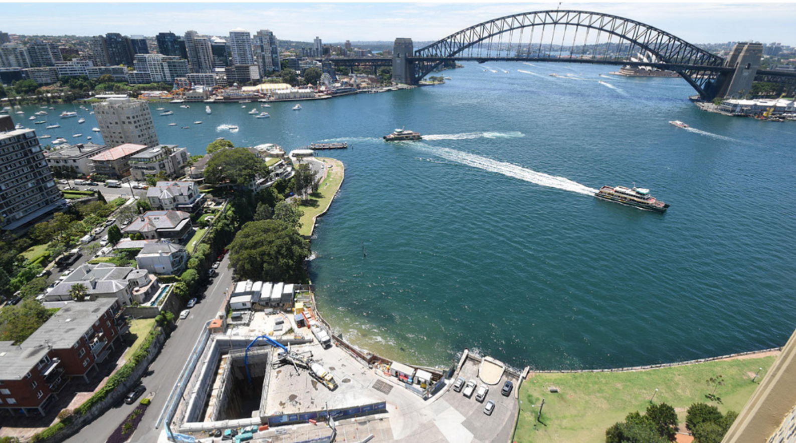
Aerial view of the Blues Point site after the acoustic shed was removed.