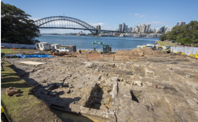
Heritage investigations during the initial excavation.

Thank you for the role you have played in helping deliver the city-shaping Sydney Metro City & Southwest project.