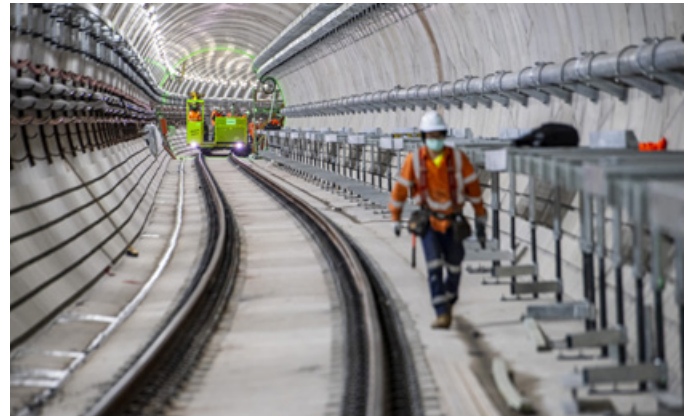
Completed section of track just north of the access shaft.