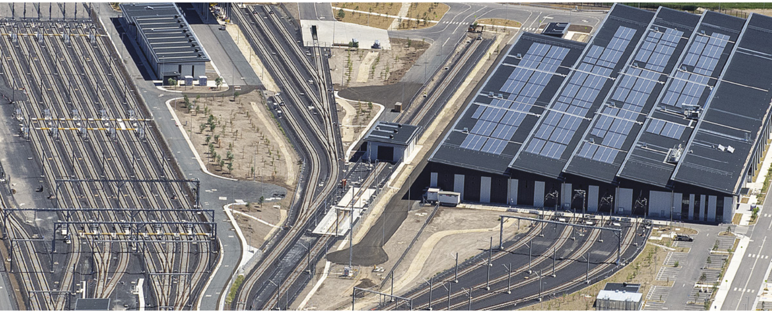
A Sydney Metro stabling and maintenance facility at Rouse Hill.