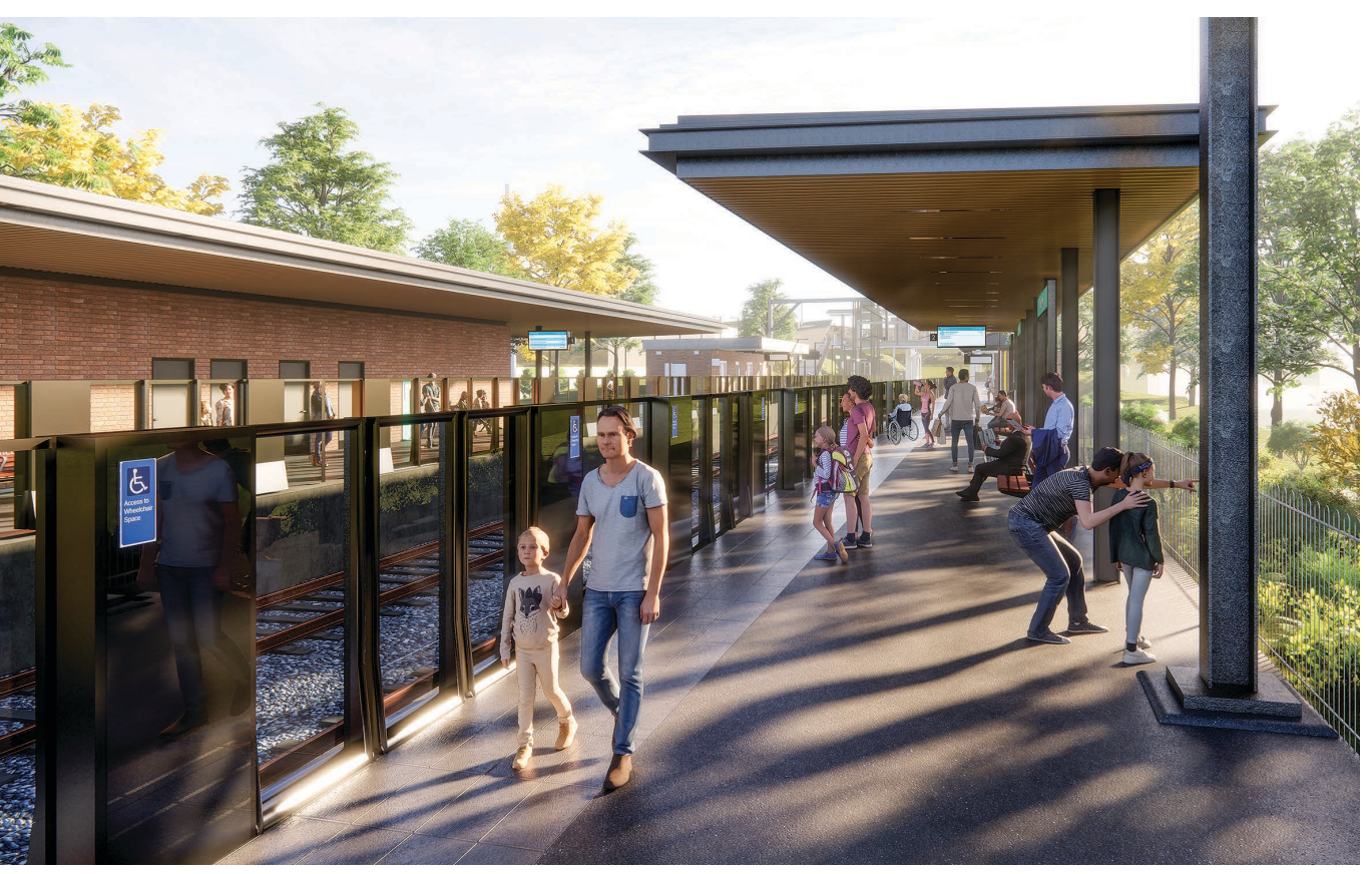
An artist's impression of Wiley Park Station.