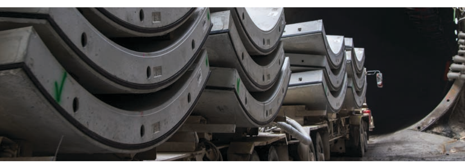
Precast segments used for the Sydney Metro City & Southwest project.