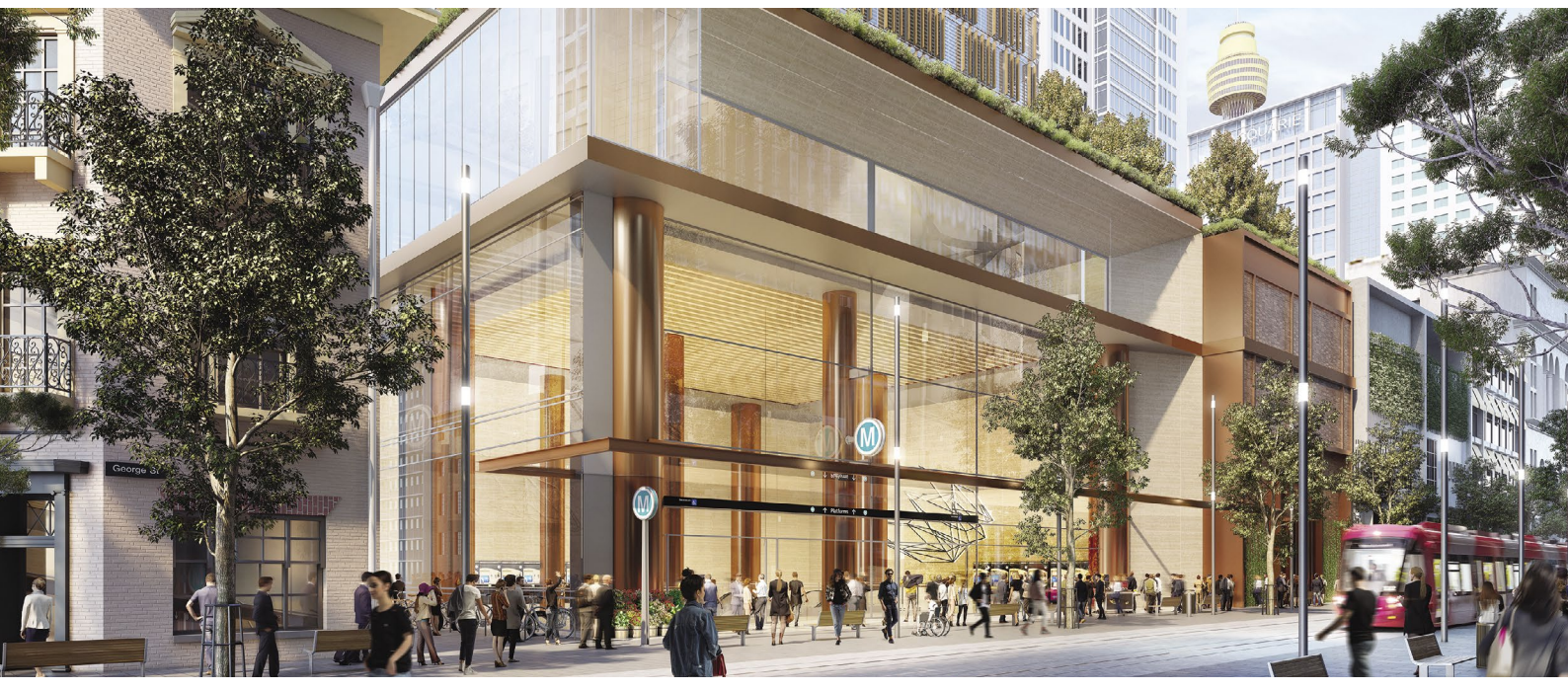
An artist's impression of Hunter Street Station.