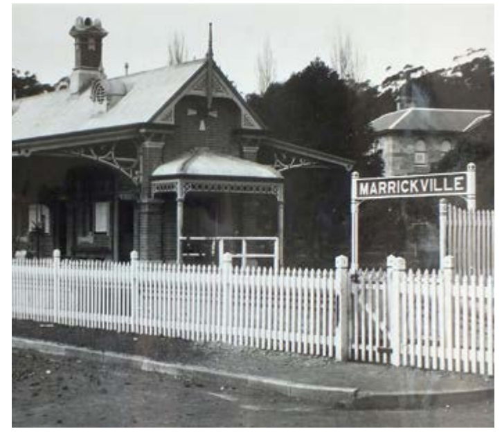
Marrickville Station 1895

Heritage listed platforms will now be re-levelled at most stations, and minor adjustments will be made to heritage platforms at Bankstown.