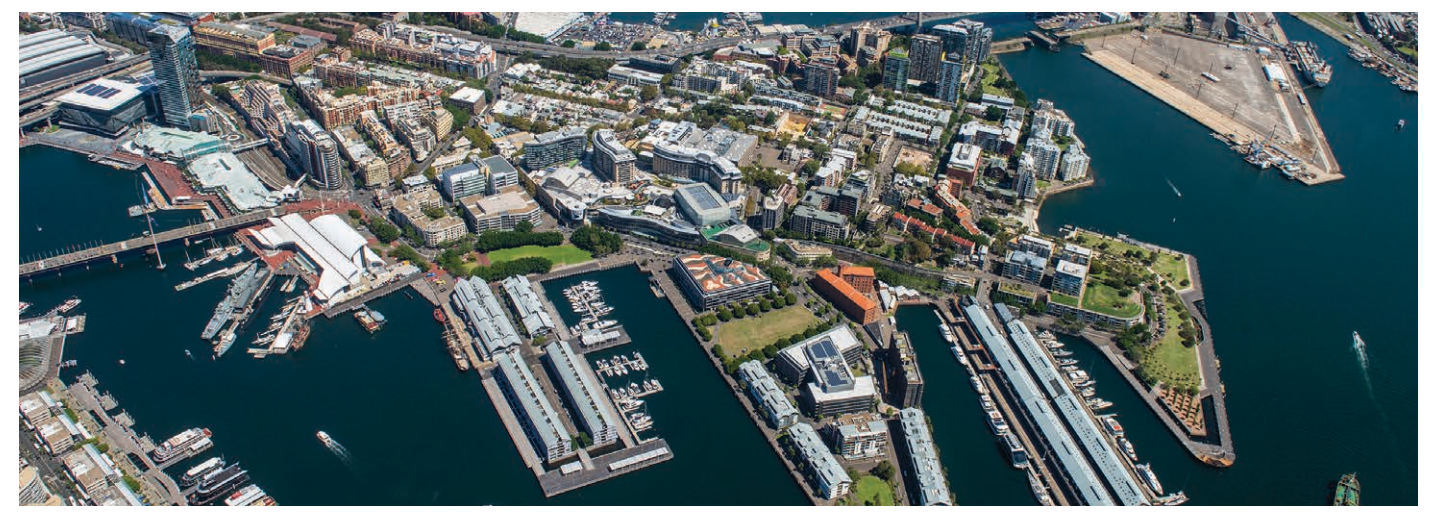
Aerial view of Pyrmont.