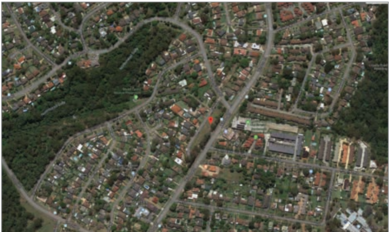
Figure 25: Model Farms Road. A platform and loop siding were located just to the south of the intersection with Model Farms Road. The location is now the Model Farms Siding Reserve. The park probably encompasses the loading/unloading area. The location is latitude -33.7772, longitude: +150.9996.

The table above shows the most likely locations of the Rogans Hill Line stations.