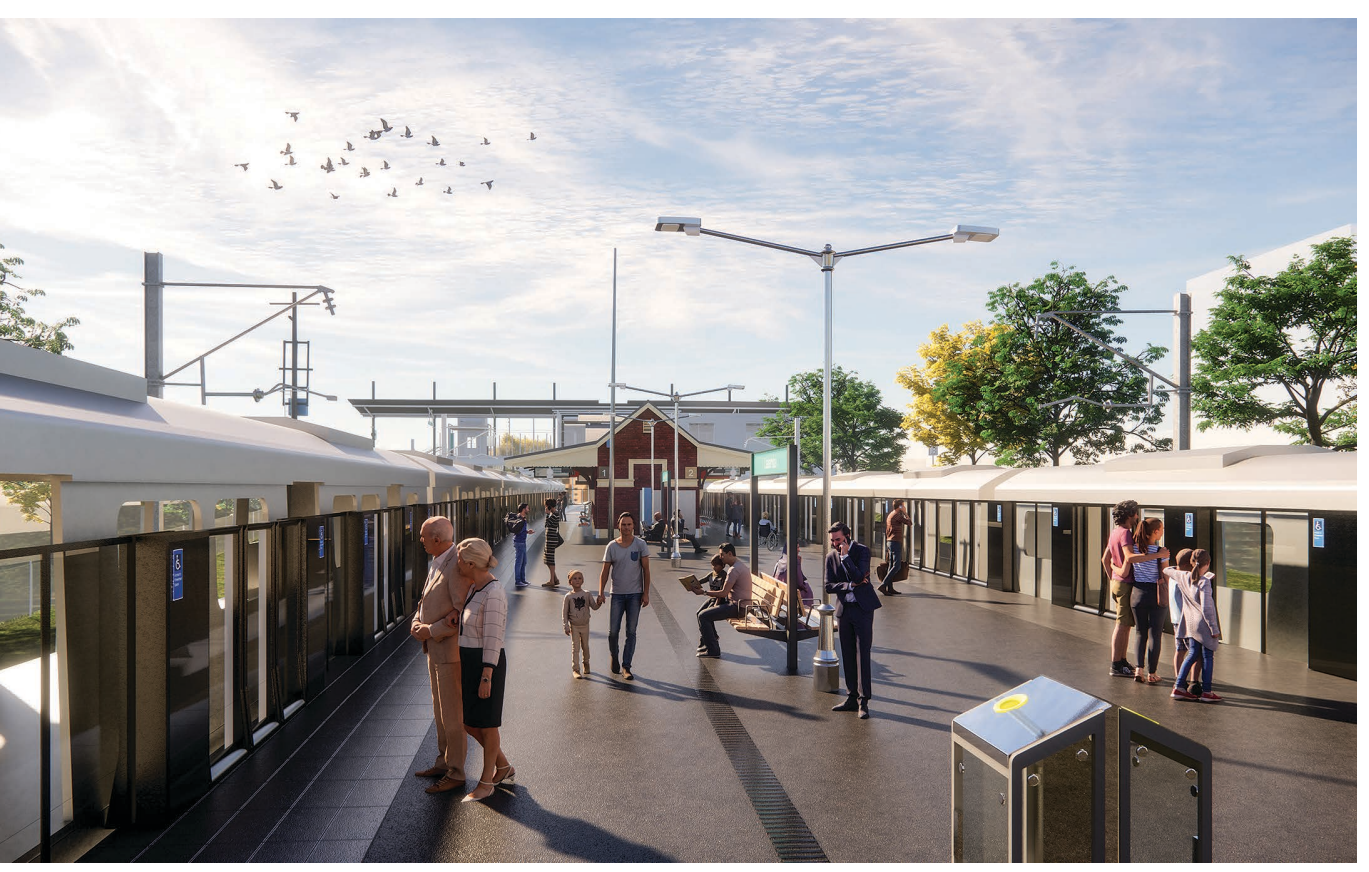
An artist's impression of Lakemba Station.