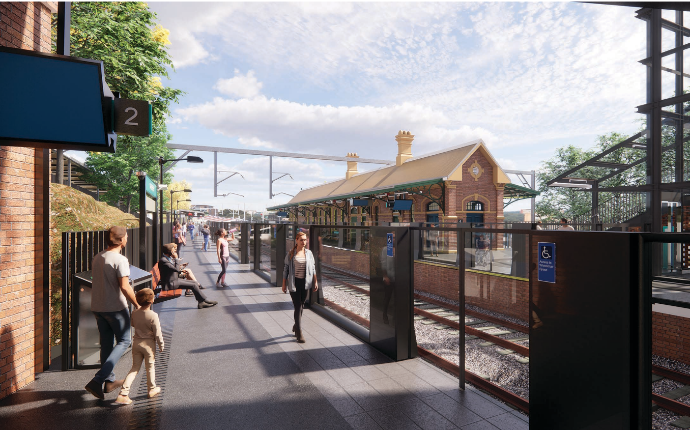
An artist's impression of Canterbury Station.