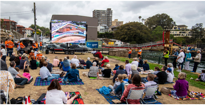
The local community watched TBM Mabel's live breakthrough into the Blues Point shaft in December 2019