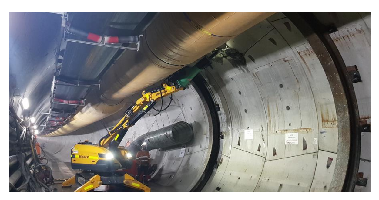
Cross passages are excavated using rock hammers like the one pictured above.