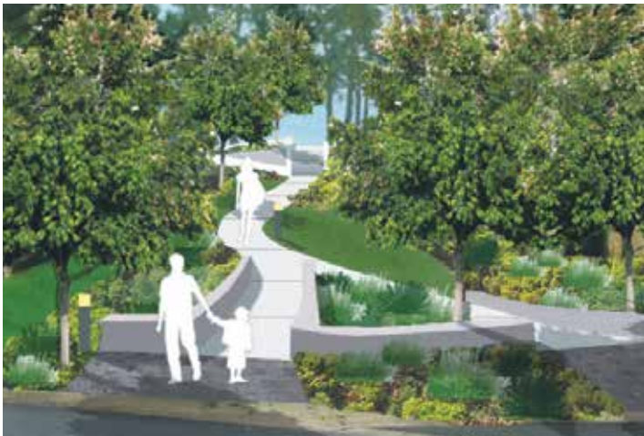
Artist's impression of proposed pathway and 'green' link (indicative only)

Constructing a new pedestrian pathway in conjunction with the pedestrian bridge would result in reduced walking times for local people. Residents who currently have a 25-30 minute walk would be able to walk to the station in less than 15 minutes.