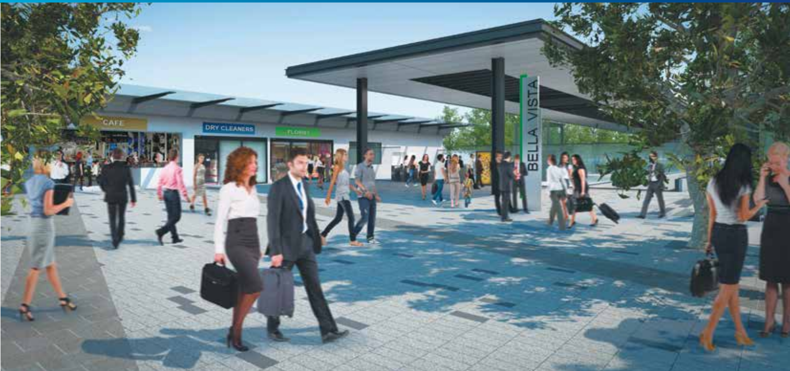
Artist's impression of Bella Vista Station