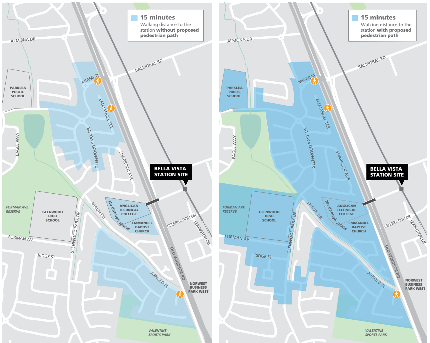
Without proposed pedestrian path