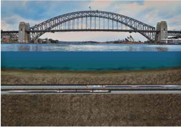
Artist's impression of metro trains under Sydney Harbour