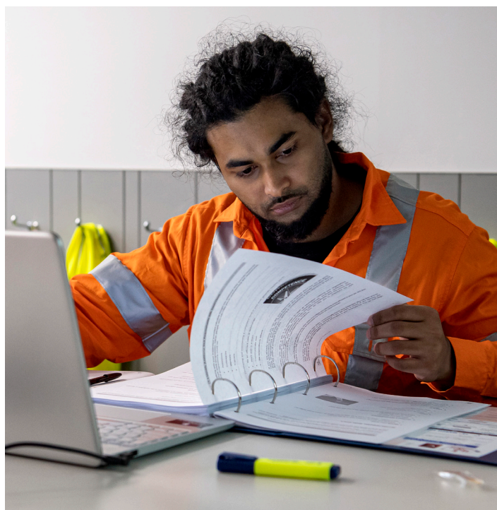
Sydney Metro pre-employment program participants training at the Health & Safety Advisory Service in Emu Plains.

Programs are developed in consultation with potential employers and delivered in line with specific job roles and existing vacancies within Sydney Metro's contract partners.