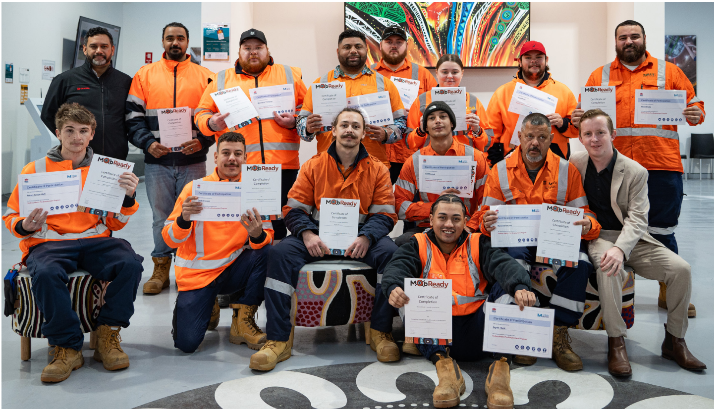
Sydney Metro pre-employment program graduates from the Metro West Western Tunnelling Package package with Gamuda Laing O'Rourke Consortium.

The model has been recognised as best practice by the Australian and NSW governments and has been successfully replicated across other industries and jurisdictions. In 2015, the program won a NSW Premier's Award in the category 'Making NSW a better place to live'.